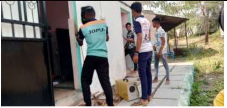
Community Service : Fabricating gate

For Regular update: www.vigyanashram.com