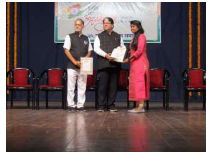
75 years of Independance

v) We registered daily-wage based employees on campus with 'e-shram card' initiative for unorganised sector labour force. It will help them to recognized under different government supportive initiative.