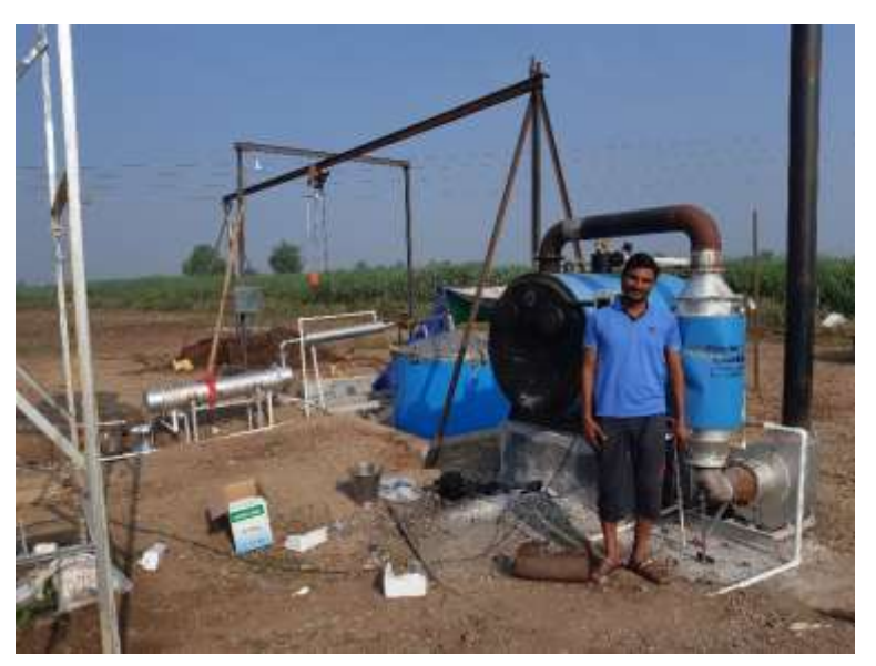
Oil extraction plant