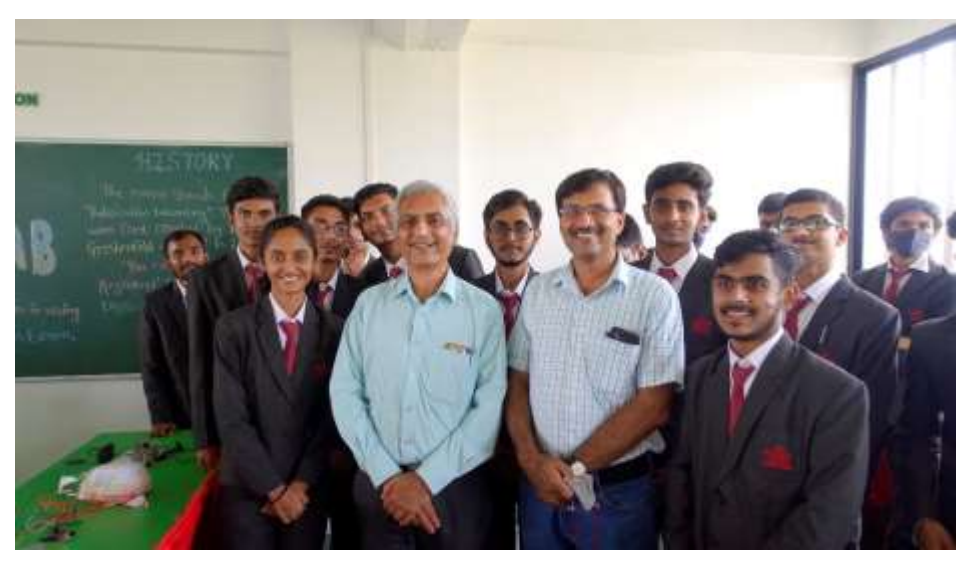
EDP @ Sanjeevani College of Engineering

Offline training @ Pabal Training campus: was attended by 17 participants including college youth, rural entrepreneur and ITI teachers Training covered various practical aspects of solar PV applications like energy load calculations, PV panel & selection installation, invertors & batteries etc. Industry experts Mr.Sanket Valse (Gramoorja Pvt Ltd),