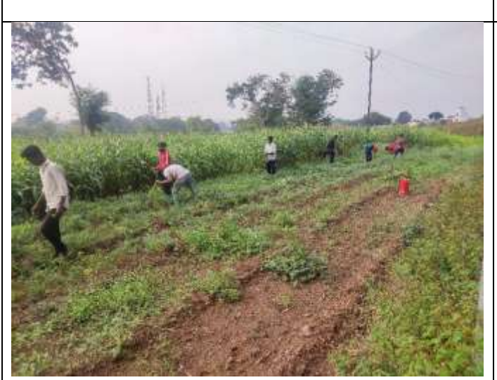
Weed control @ DBRT