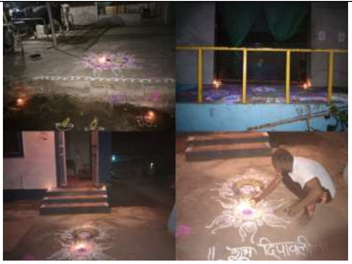
Diwali Celebration on Campus