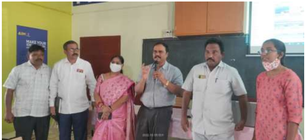
ATL session @ Guntur

DIY lab Pune updates: We have to stop off line classes due to COVID advisory. We have conducted two sessions on Otto block coding (8 th January) and fabrication of automated switch (22 nd January) as their weekly activity class. Pooja is also visiting IBT school students and helping them in their project at home.