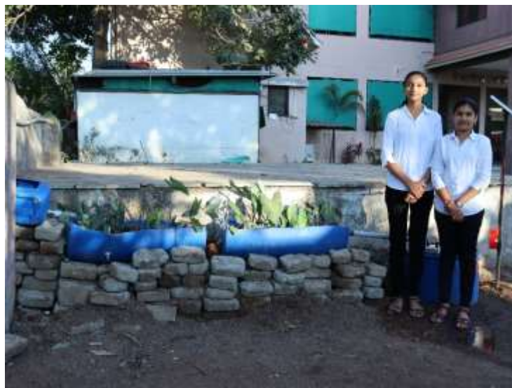
Grey water system @ Nande school