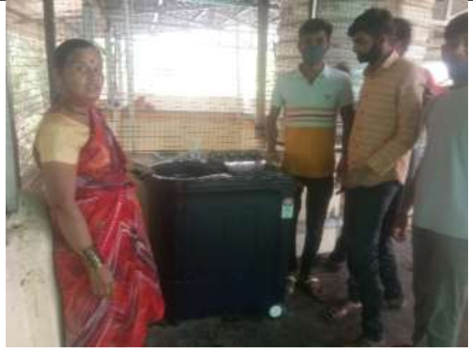
DBRT students repaired washing machine @ Ladies hostel