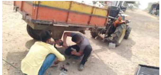
Students replacing bearing of tractor