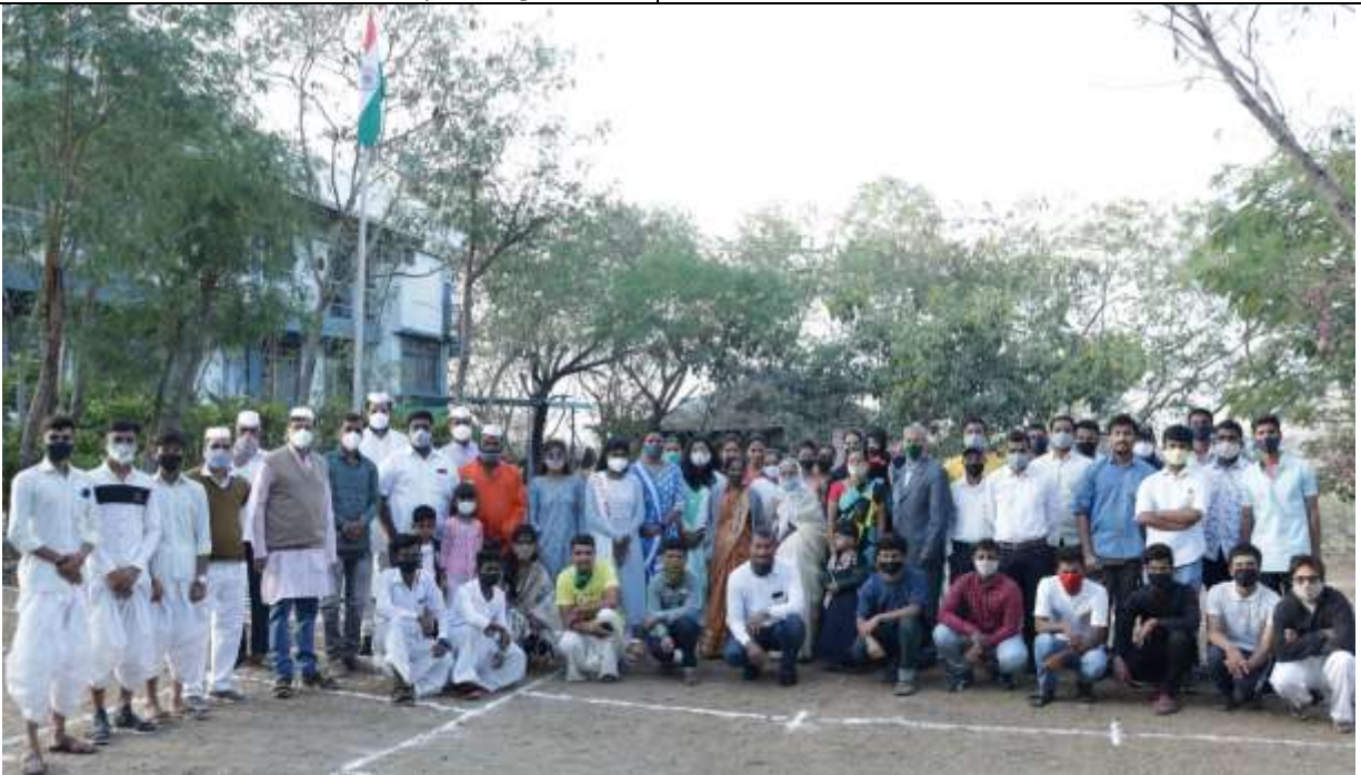
Team Vigyan Ashram on 26 th Jan 2022