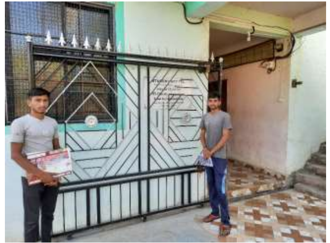
Students with Fabricated gate by them