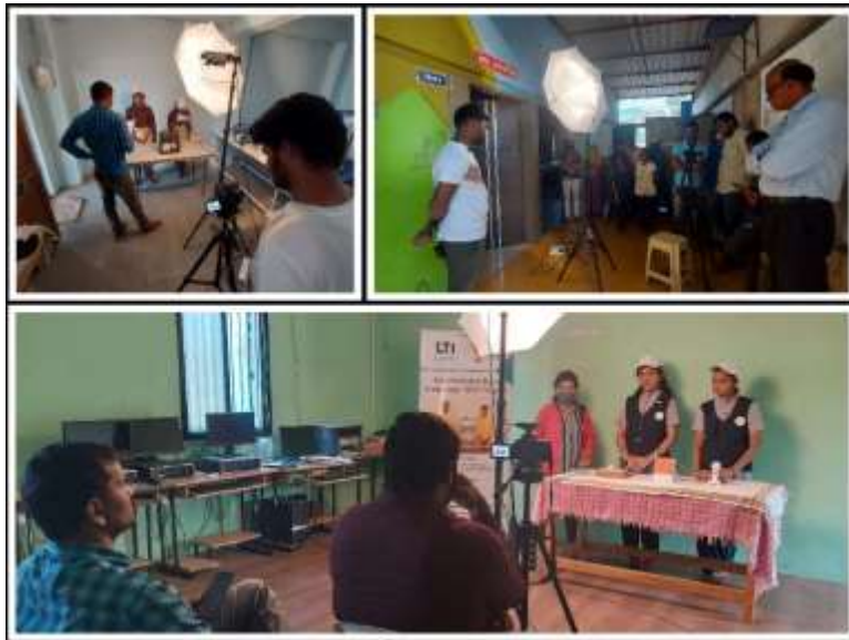
Preparing for Technovation