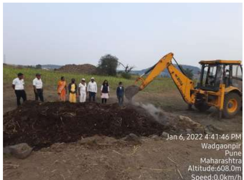
Composting bed at Wadgaon pir