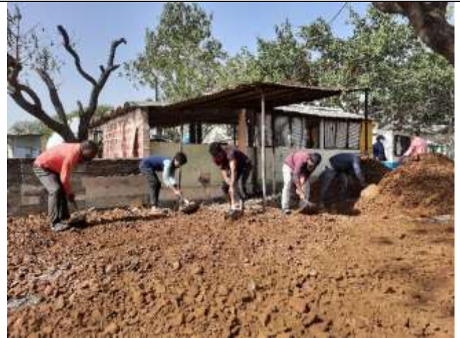
Shramdaan : Preparing sport ground on campus