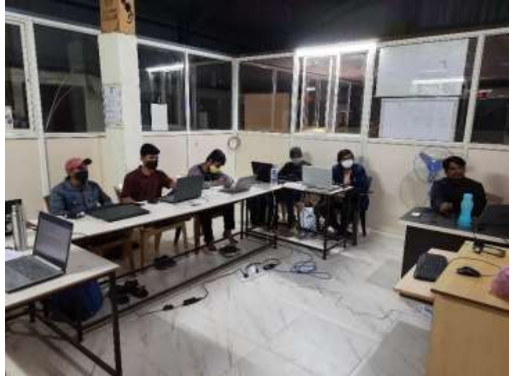
Fab Academy class in progress

Details of course and students are on : https://fabacademy.org/2022/labs/vigyanashram/