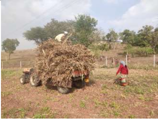
Dry fodder collected from our farm. End of season