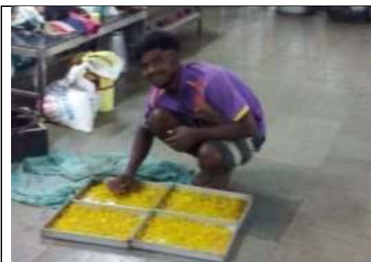
Ganesh making candy