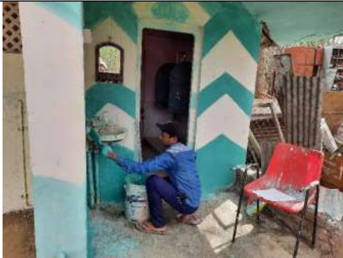
DBRT students contract : Toilet painting