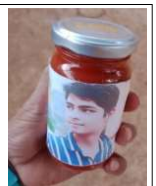
'Sumit' brand sauce