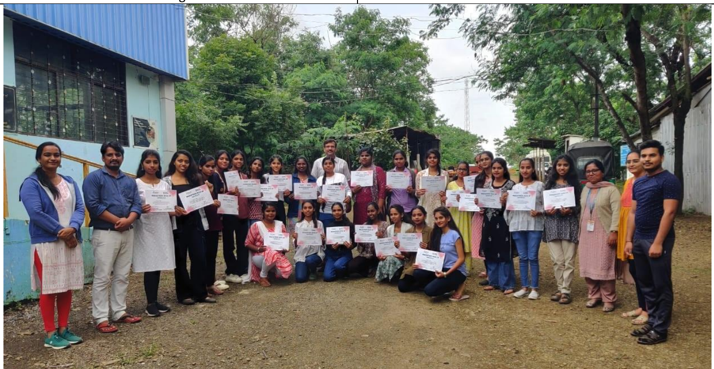
Make-a-thon for students from Tikaram Jagannath arts, science, commerce college, Khadaki (Pune) @ Vigyan Ashram, Pabal

For Regular update: www.facebook.com/vigyan.ashram.pabal ; www.vigyanashram.blog www.vigyanashram.com