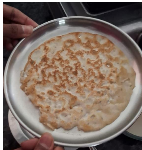
Dosa from barnyard-millet (Bhagar)