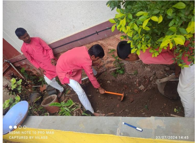
Soak pit making activity @ Salumbre

Students earned net profit of Rs.2594.00 through this activity. Rakhi making & sells activity was also organized by 10 more IBT schools in Talegaon & Pune region.