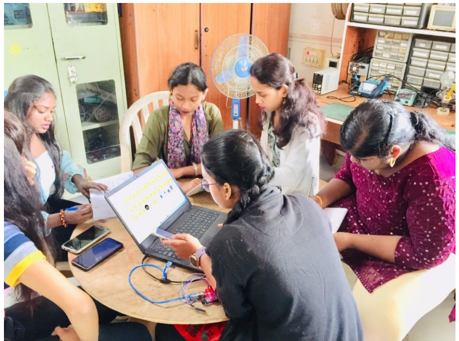
Make-a-thon for rural girls

Government ITI participated in the training. To demonstrate their