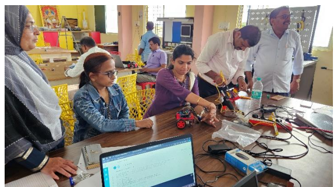
Teachers training @ Nasarapur (Karnataka)