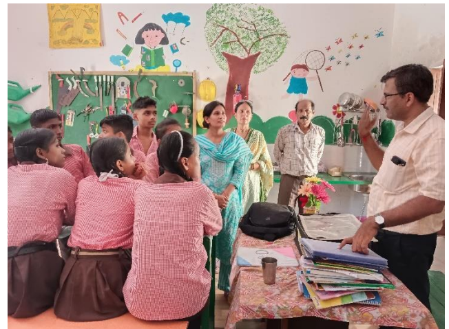
Visit to LBD program @ Nandgram