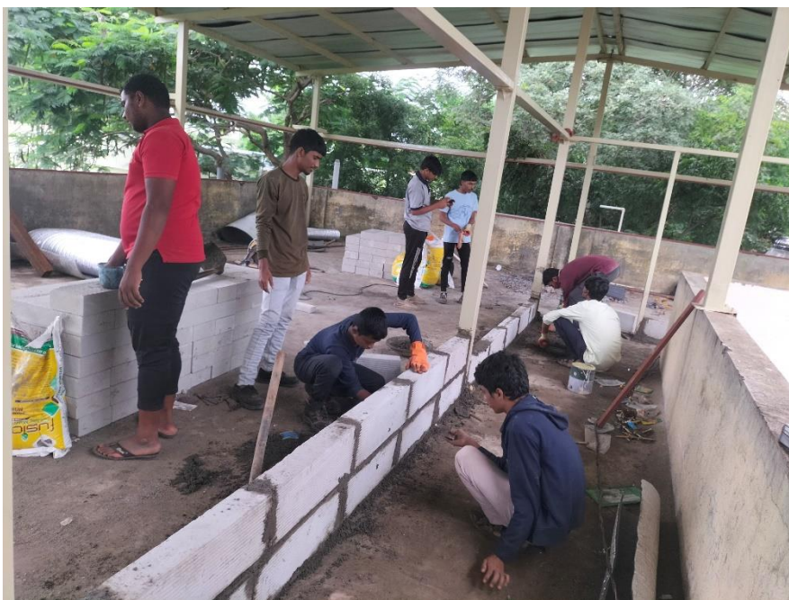
DBRT students learning construction skills

Energy & Environment: Students learned electrical switch board fitting for house wiring. Students prepared 16 switch boards against contract order from local electrical shop. They also learned making of LED strip-light while making 2 decorative stripes. Students repaired two High Pressure (HTP) pumps and water-pump while learning motor-rewinding skills. Total value of their community service was Rs.16890/-.