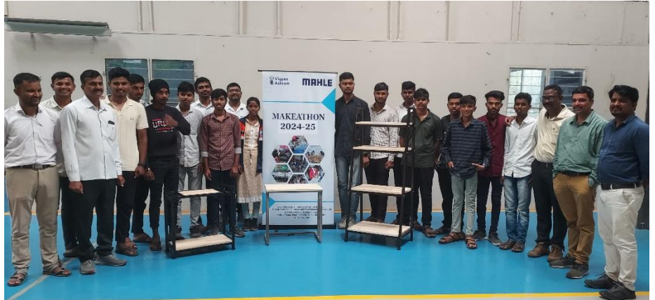
Make-a-Thon for Rural Industrial Training Institute

During last academic year, we have successfully conducted 5 make-a-thon for girls from science colleges. La-fondation sanctioned five more Make-a-Thon for 100 girls. First batch of 26 girls from Tikaram Jagannath arts, science, commerce college, Khadaki (Pune) participated in the Make-a-thon from 6 th -10 th August. Girls learned CAD modelling, Arduino programming, basics of sensor application, 3D printing etc. skills while working on different project ideas. The program is becoming popular and many colleges are showing interest for participating in the Make-a-Thon.