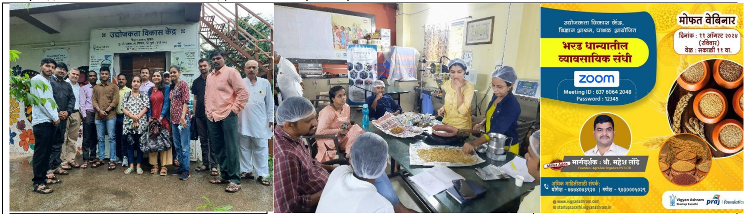
Training on Millet processing

A special session on online marketing was also conducted by Mrs. Pragati Gokhale (founder of https://www.marketmirchi.com/ ) for trainee participants.