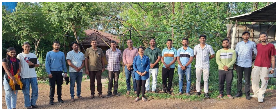
Visit of Eaton Volunteers