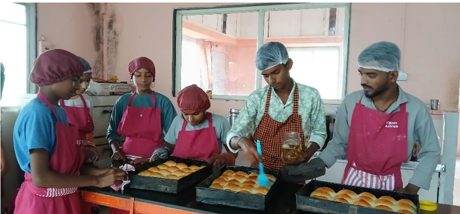
Students learning bakery skills

Students processed 40 kg of dragon-fruits for making jam (2.5 kg) & syrup (10 kg). Students supplied 150 chocolate-candies for 15 th August program and processed 69 kg of bread-flour for supplying bread to kitchen. Their total community service earning was Rs. 17350/- during August month.