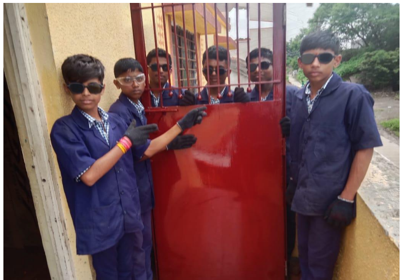
Safety door by Gulani IBT dept