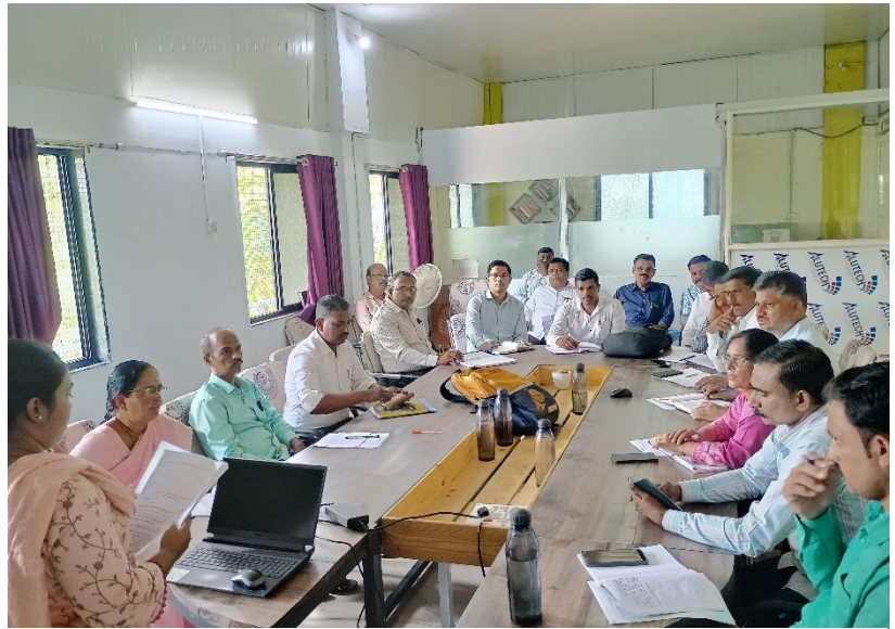
IBT Co-ordinators training @ Pabal

i) 3D printing & sensor application training: IBT instructor's training on 3D printing & sensor application (electronics) was conducted during 12 th to 14 th August at Pabal. Training was attended by 17 instructors to learn basic CAD designing (TinkerCAD), 3D printing, user of Arduino programming board, using sensors etc.