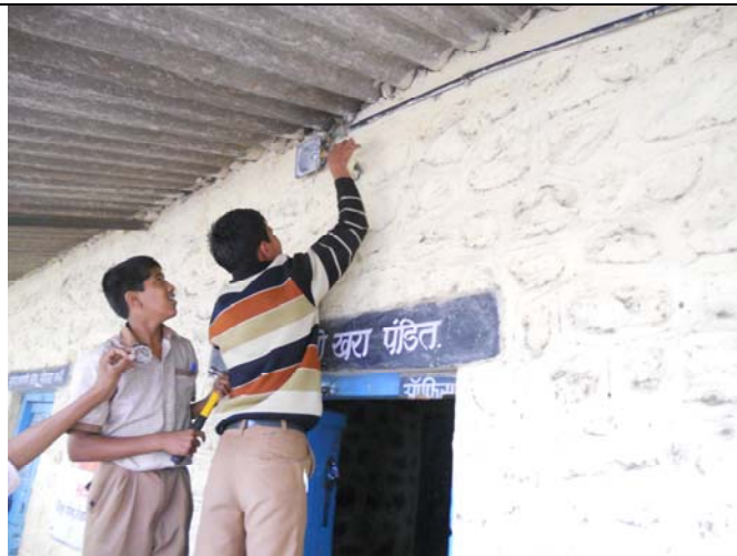
Thangaon IBT - कृतीशील तोच खरा पंडीत