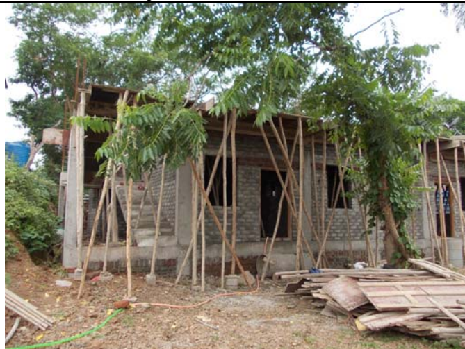
Staff Quarter status