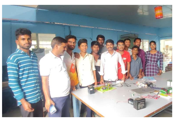
ii) Engineering section:

i) Energy & Environment section: Students installed new DOL starter & 5 HP pump in the well. They had carried out servicing of diesel generator while changing its engine oil, airflirters etc and installed bio-gas tank. Students visited Pune electronics market on 11<sup>th</sup> September to study market & purchase spares required for mini-inverter (150 watt) and battery charger (30-volt AC-DC converter). Students assembled the invertor parts and sold it to shop owner for Rs.1600.00 (assembly cost 1430/-).