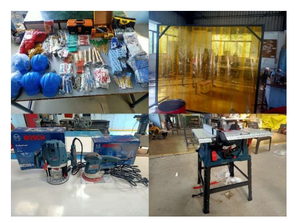
Tools, welding curtains for workshop

We are doing modernization of workshop at Vigyan Ashram with the support of M/S Mahle Engineering. We have purchased new tools (Bosch- Hammer hand drill, Plunge router, Random orbit sander, wood cutter and Tig welding machine). We have completed fabrication of welding curtain, erection of new lightpole in the workshop department. In electrical section furniture repair, installation of TV screen etc work is completed. Storage cupboards and hand tools, safety gadgets are purchased for electrical section. Fabrication work of new audio-visual classroom is under progress on 1st floor of administrative building.