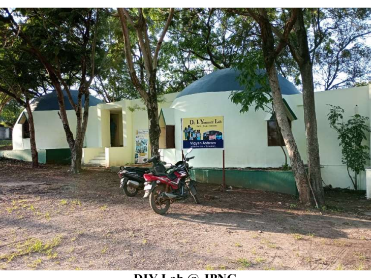
DIY Lab @ JPNC