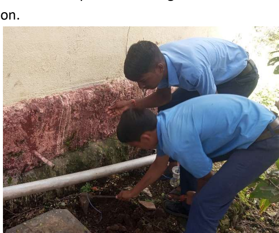
Installation of earthing

■ Students of 9<sup>th</sup> & 10<sup>th</sup> class in Tulapur school prepared Infra-Red (IR) sensor based 'Bless Me Ganesh' idol in school. The IR sensor was fixed to card-board made Ganesh-Idol to bless devotees during puja . Students learnt basics of electronics, sensor application etc through this activity.