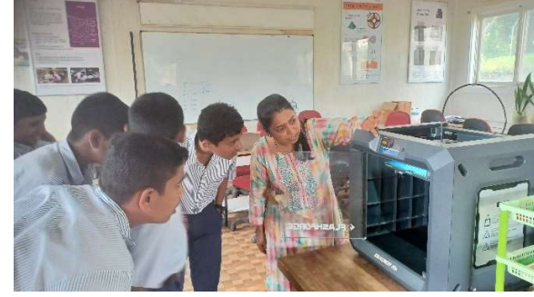
Session on 3D printing

36 instructors from 9 schools supported by Schaeffler India CSR initiative.