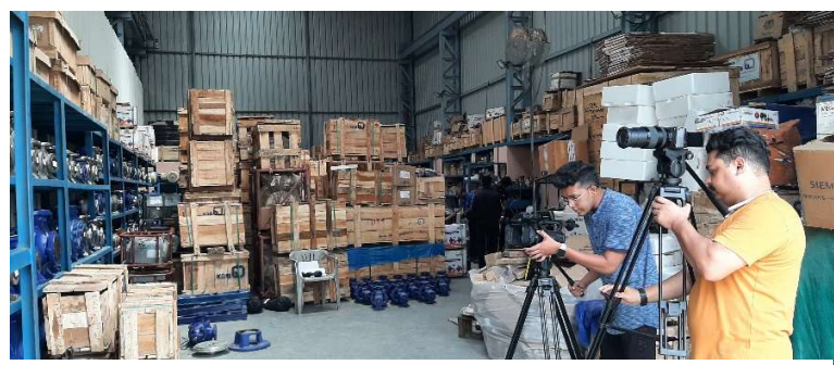
Video Shooting @ pump workshop