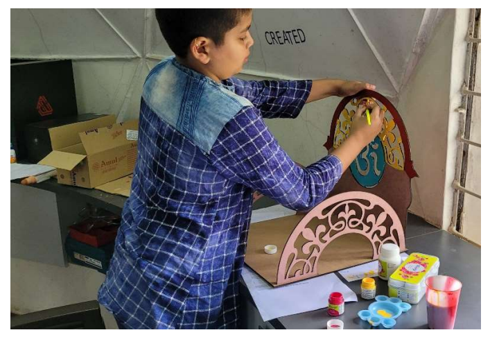
Makhar for Ganesh festival

iii) Papertronics Greeting card: https://youtu.be/b5iXLQutiDU