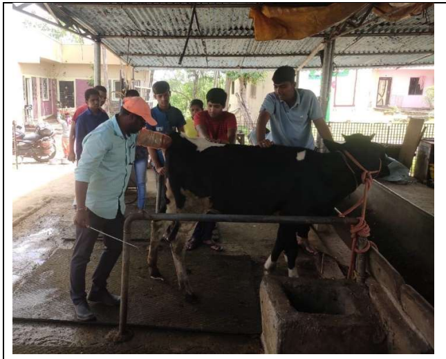
Artificial insemination of cow

experiences. They harvested methi (15 bundles), bottle gourd (42 kg).