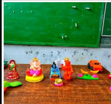
Clay model activity @ Harwara school @ Prayagraj