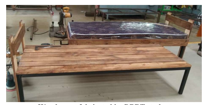
Wooden cot fabricated by DBRT students

iii) Home & Health section: Students processed 20 kg lemons for making squash (21.250 lit), pickle