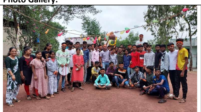
Dahi handi Celebration