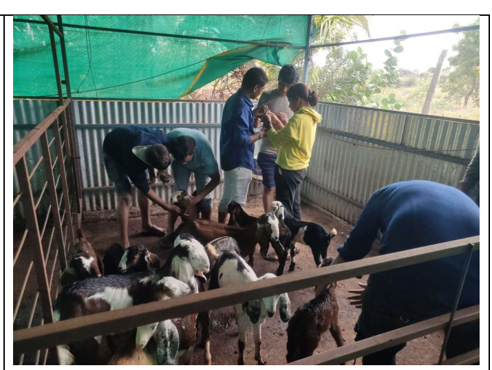
Deworming of cow

<u>v)</u> Team of 6 students learnt advanced DTP skills in 15 days elective course. They prepared visiting cards, posters, by using Canva & Corel Draw software, video editing, 3D designing (123 CAD) and basic programming software (scratch) during the course. (VATF)