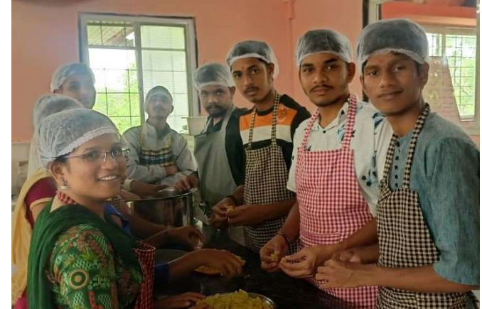
Students preparing lemon squash

Students visited progressive goat farmers & polyhouse farmers in the area to learn from their experiences. They harvested methi (15 hundles) h