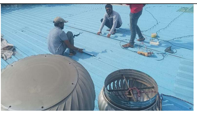
Turbo ventilator fitted on Workshop roof

For Regular update: <a href="www.facebook.com/vigyan.ashram.pabal">www.vigyanashram.blog</a> <a href="www.vigyanashram.com">www.vigyanashram.com</a>; <a href="https://vigyanashram.online/">https://vigyanashram.online/</a>