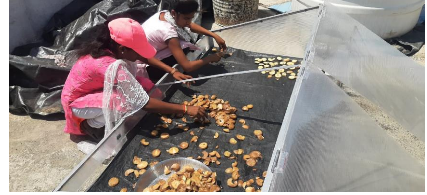
placed at Gurudatta Electrical DBRT students : Drying of Chikku flakes Manchar (Pune) for learning domestic electrification & home appliance repair work.