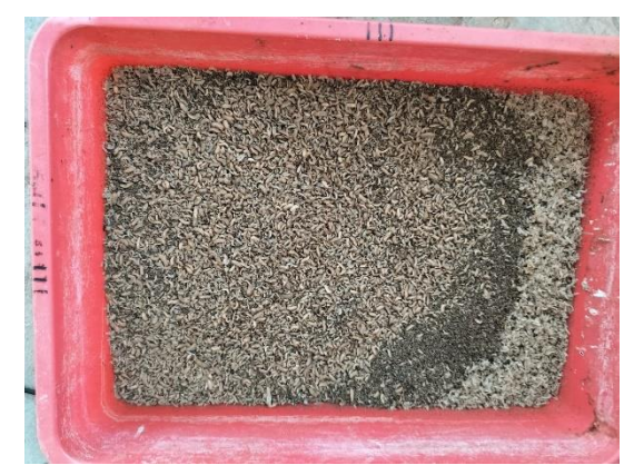
5 days old larva