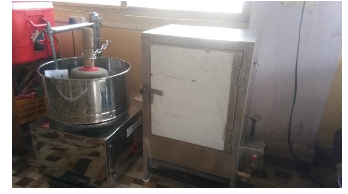
New Idle grinder and steamer for kitchen

iii) Electrical section: Hrushabh & Sudam installed new Idli grinder and steamer in kitchen. They also repaired & installed 2 CCTV cameras in campus. Yash & Guran installed 3-Phase electrical connection for grape-dryer. Total value of oncampus community service was Rs.34830.00