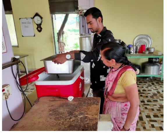
New curd maker made in the Fab lab for kitchen