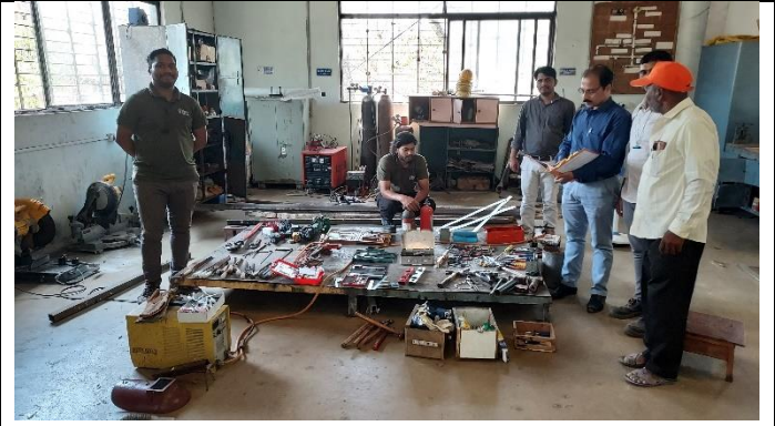
Inspection by board of vocational education for Welder fabricator, electrician and solar technician courses.