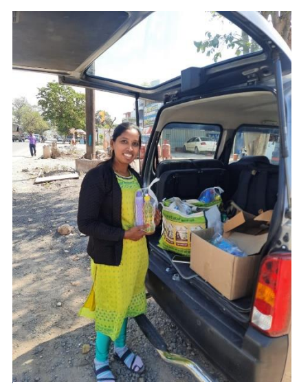
Pratiksha - Well Done Marketing Services