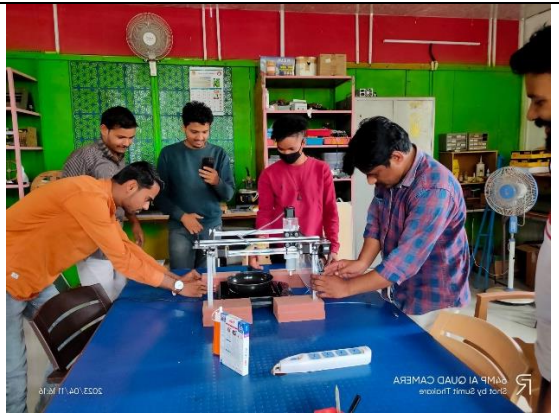
Jalebi making machine trails: Fab Academy