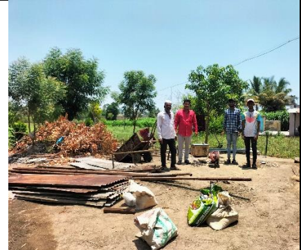
Internship @ FRP shop