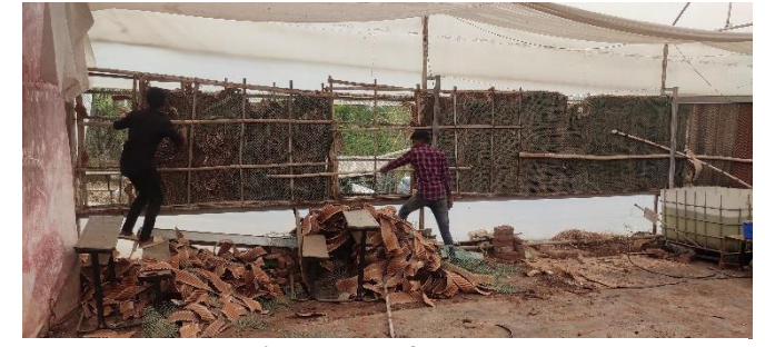
Maintenance of polyhouse

skill-training course accreditation for 4 different courses in Electrification, Solar PV installation, Welding fabrication & Food processing section.