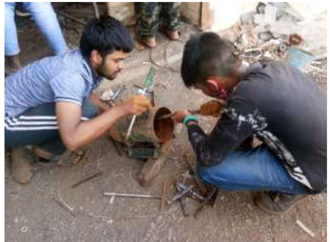
Electric motor repair