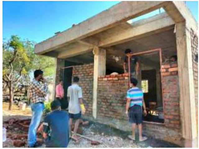
Construction of recreation center