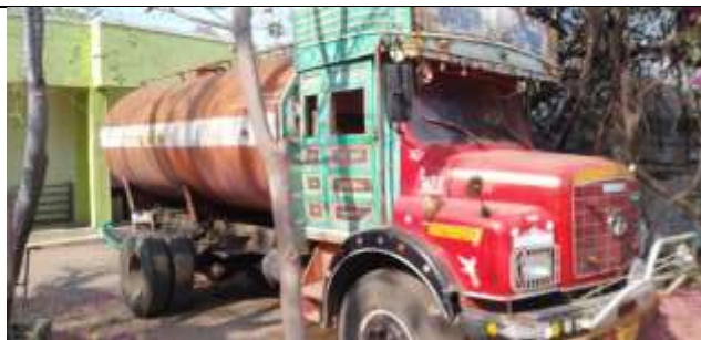
Water tanker every alternate day ..