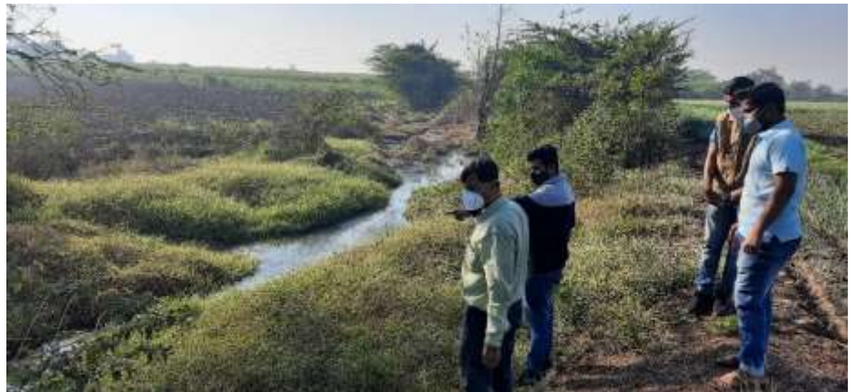
Site @ Digrajwadi