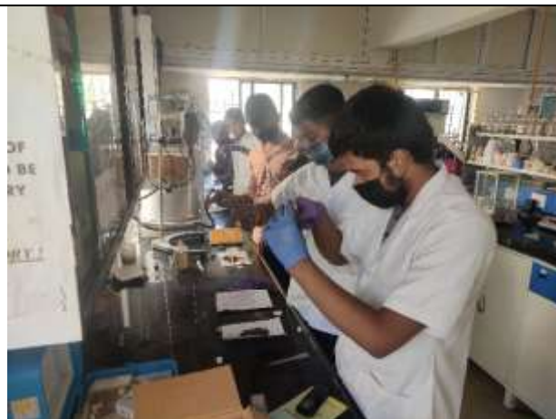
DBRT students doing soil testing