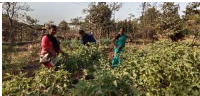
Brinjal @ IBT school - Chikhali

For Regular update: www.facebook.com/vigyan.ashram.pabal ; www.vigyanashram.blog www.vigyanashram.com