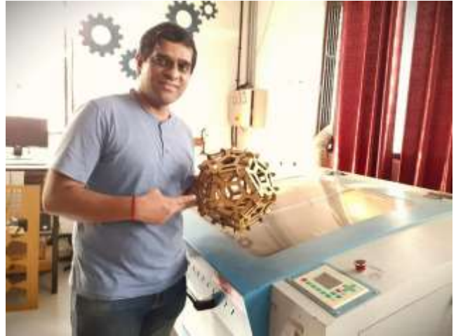
Fab Academy : Laser cutting assignment

vii] Fab-academy update: Fab-academy classes are progressing well. Students are busy with weekly online session followed by lab sessions. During February student learnt & performed tasks CAD modelling, computer-controlled cutting, 3D scanning & printing etc skill performed tasks to demonstrate learnings. Students learning can be found on- Fab Academy2022 | Vigyan Ashram