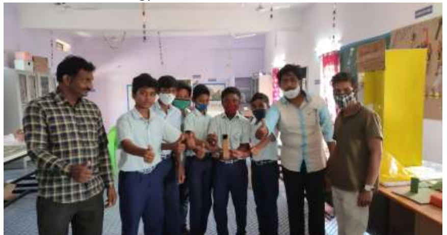
ATL Reddigudem, Andhra

https://www.youtube.com/playlist?list=PLfb0AVQ89OKaBMw4aNuHHN3Ckxz8jrmwa