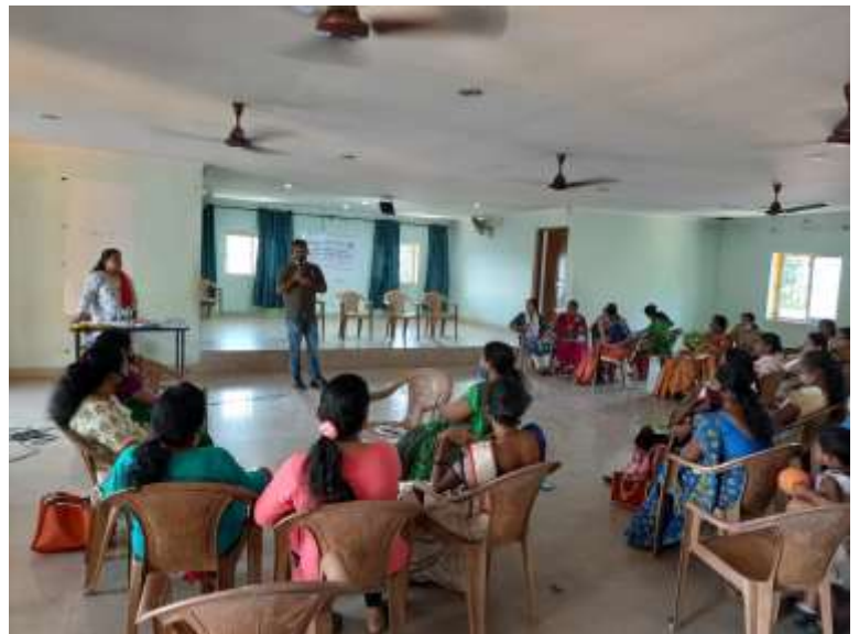
Women EDP @ Goa

ii) 'Entrepreneurship Development for Woman Empowerment' (2 nd batch) was conducted at Navilliam village (Panaji, Goa) during 16 th to 19 th February in collaboration with 'Vanarai'. The 4 days training included classroom & field sessions on identification of business opportunities, market survey, business modelling etc. Training was attended by 28 WSHG participants from nearby 5-6 villages. Mr. Sachin Punekar and Mr. Yogesh Onkar conducted various session & guided the participants.