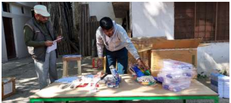
Handover of tool inventory @ UP schools