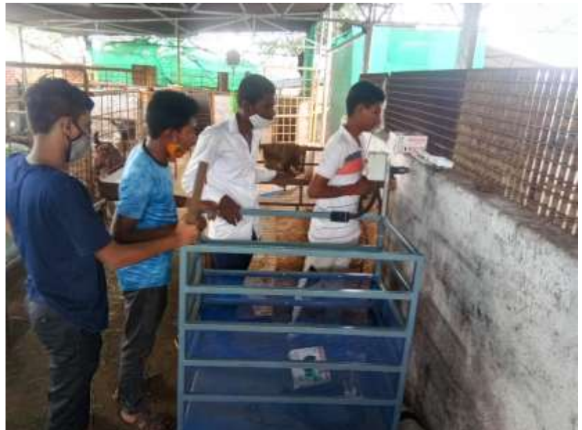
Installation of Goat measurement unit

Energy & Environment section: Students of electrical department learn basic of electrical fittings while repairing plug points in boys hostel. They also installed new ceiling fan in DIC hostel and DOL starter at 'Thitewadi' hostel block. Students generated community service of Rs.13206/- while doing these works.