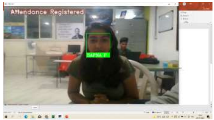
Face Recognition based attendance system