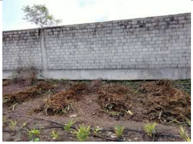
Experiment @ Fursungi farmer on biogas slurry as culture