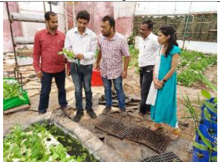
Hydroponics training @ Vigyan Ashram

For Regular update: www.vigyanashram.com