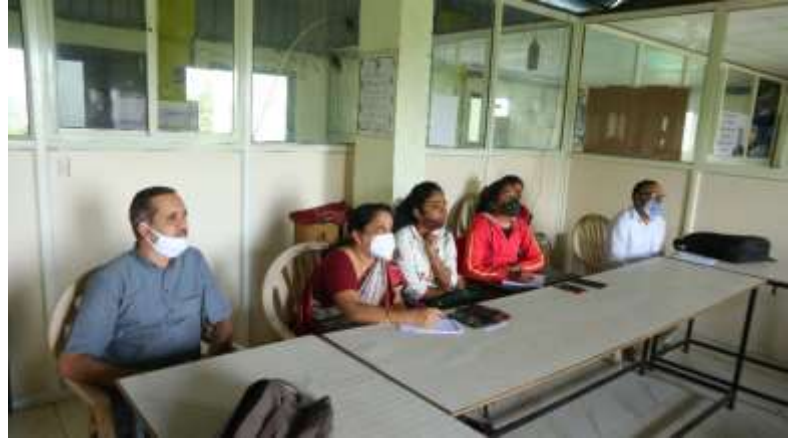
Wikipedia Training at Pabal