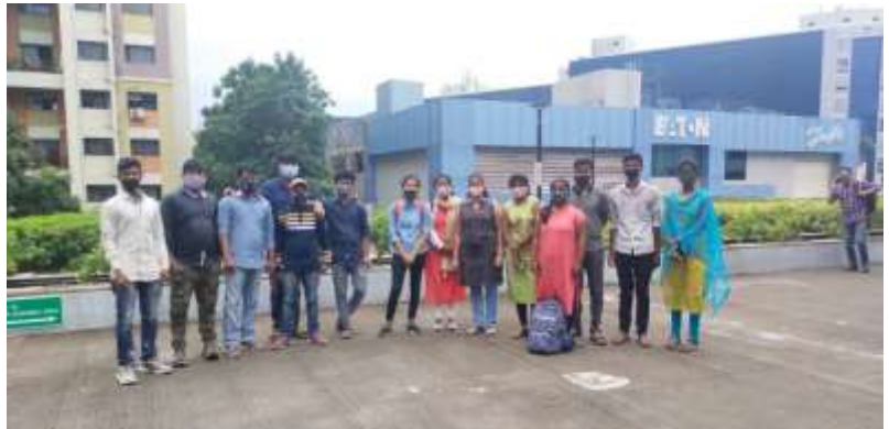
COVID vaccination of all staff of Vigyan Ashram has been completed with the help of Eton foundation. Team @ Eton premises for vaccination