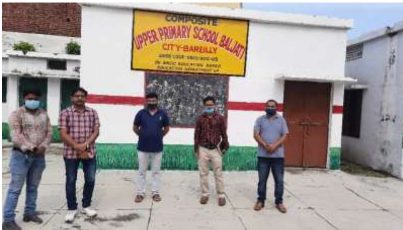
Visit to school in Bareilly