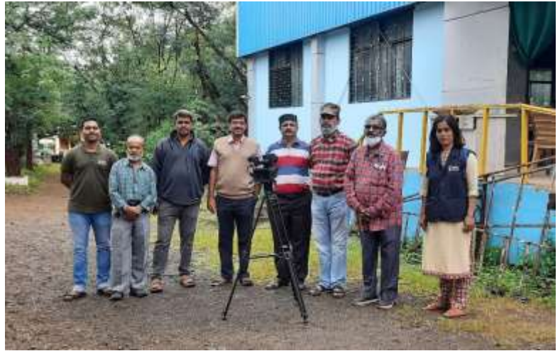
VA and EMRC team