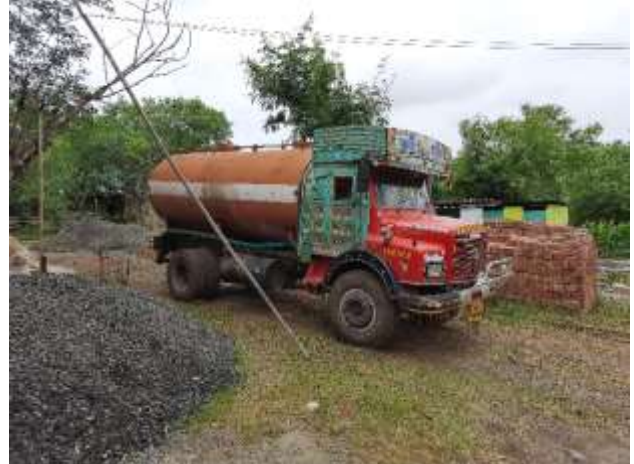
Purchased first Water tank in Aug .. Deficit in rainfall so far