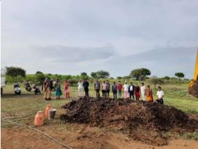
Agri waste composting at Wadgaon peer