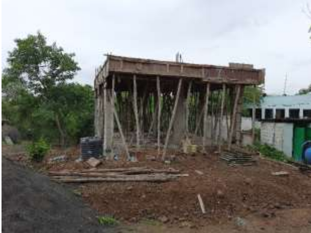
Status of Boys hostel recreation room