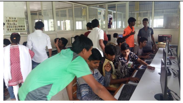
DBRR : Project completion