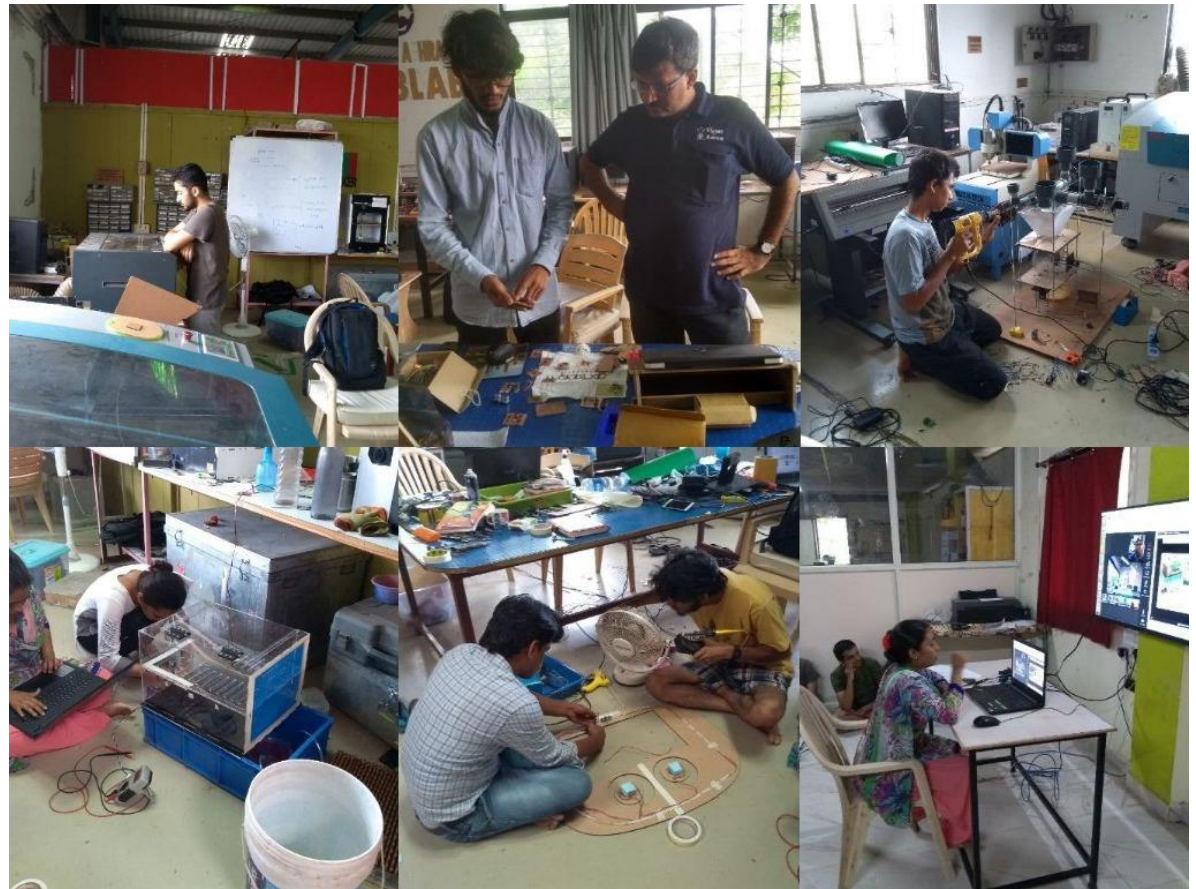
Fab Academy 2018 : Moments in June 2018

B] Completion of Fab Academy 2018 course : Six months Fab Academy classes were concluded on 6<sup>th</sup> June. 7 out of 8 students from Vigyan Ashram gave their project presentation on 15<sup>th</sup> June. After local and global evaluation, Seven students graduated from Fab Academy. They will get certificate in Fab14 conference at France. Details of students and their projects and presentation videos are available on : http://fab.academany.org/2018/labs/fablabvigyanasharm/