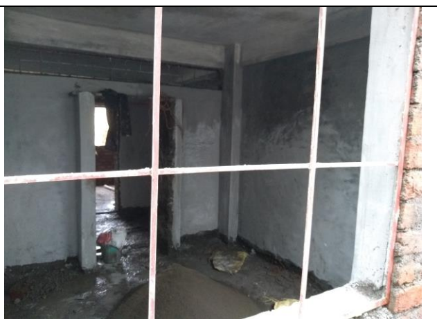
Status of new hostel room