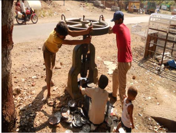
DBRT workshop students - making dome kit using press.