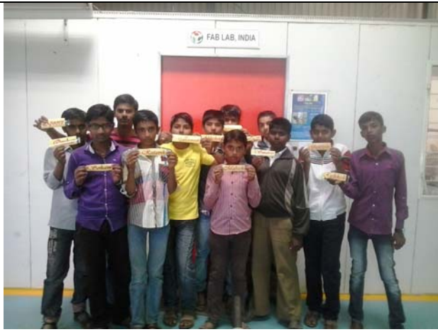
High school students in Fab-Camp Vinyl cutting training.