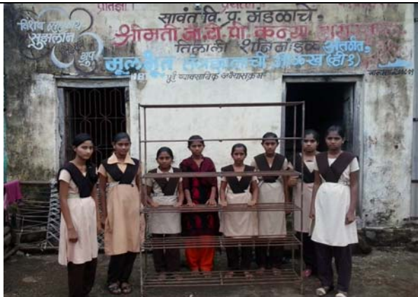
IBT Shanimandal (Nandurbar district) Girls school – Workshop section activity