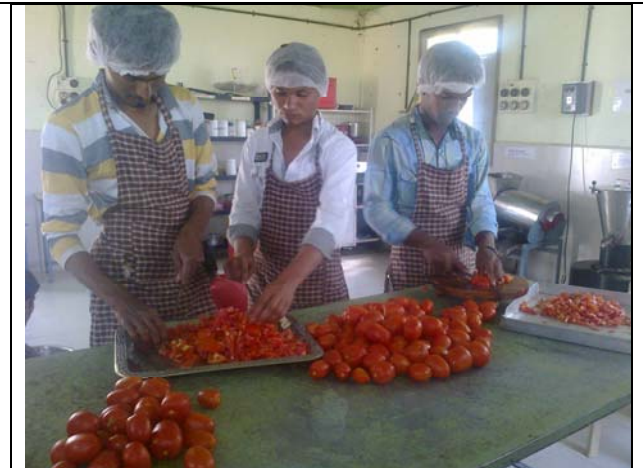
Tomato processing in food processing unit.