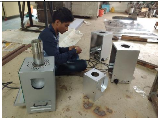
Incinerator at getting ready