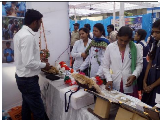
IBT stall @ Child right convention organized by UNICEF @ Raipur