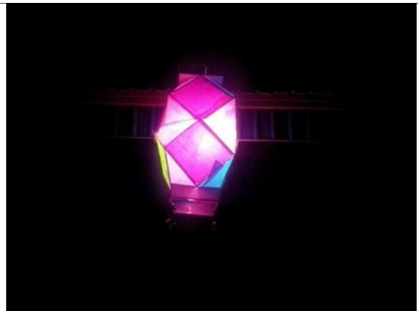
Sky Lantern : Diwali