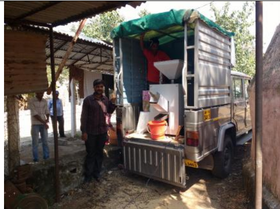
Despatch of rice husk machine

For regular update : https://www.facebook.com/vigyan.ashram.pabal