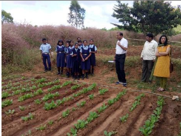
Visit of DFID team to Odisha EMRS IBT program