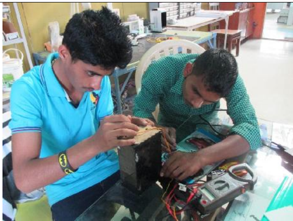
DBRT students – fab class