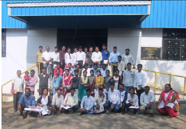
IBT Instructors Training @ Pabal