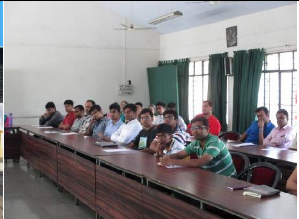
Maker Meet @ JPNC on 1 st Nov