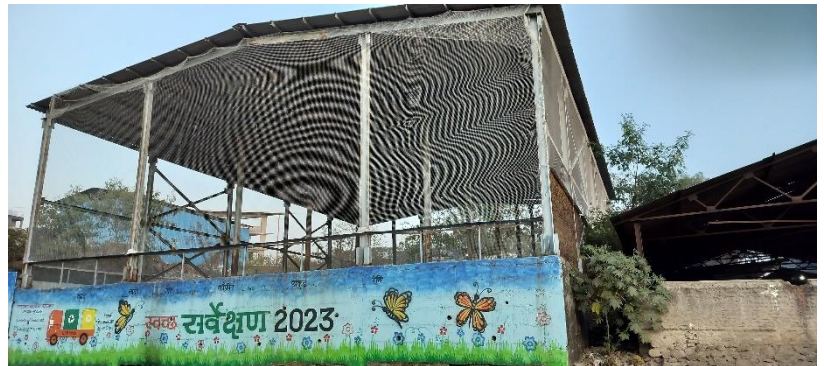
BSF shed @ Rajgurunagar dumping shed