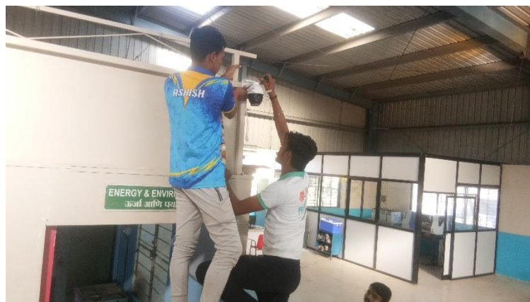
Learning CCTV installation