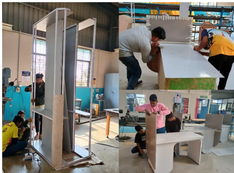
Wood working @ Workshop

ii) Workshop section: We have got new tools in the carpentry section. Students have made four office tables. They have also made a product display (show-case) for entrepreneurship section. They learnt wood cutting, polishing, Sunmica laminate sheet fixation etc. skills. Total value of community service provided by student was Rs. 53116/-.