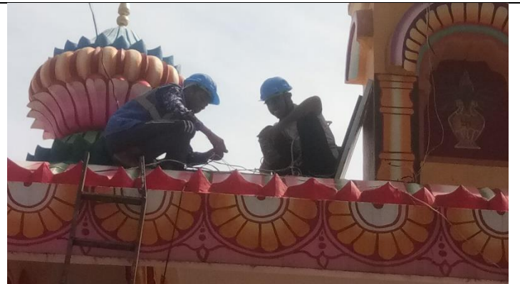
Shramdaan @ Bhairavnath temple - Electrical maintenance