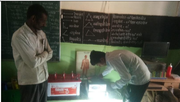
Shramdaan @ ZP High school, Zhodakwadi – Inverter repair