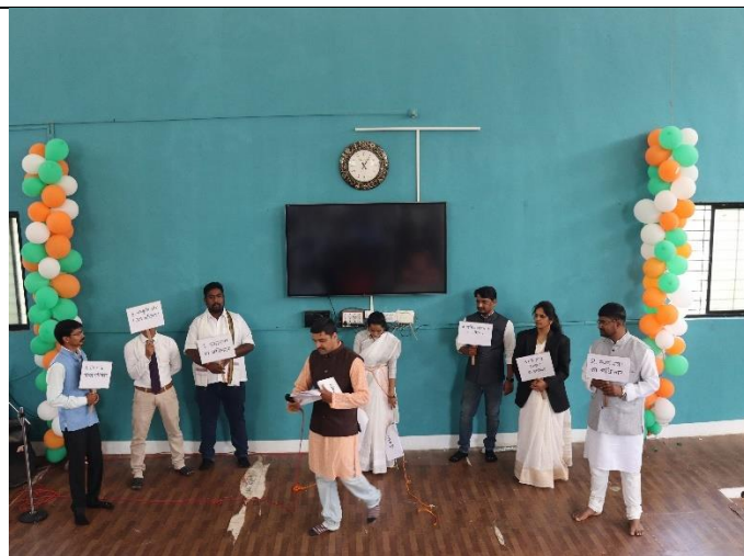
26 th Jan cultural program