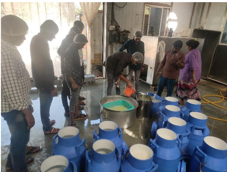
DBRT students @ Kunjir Dairy

iv) Agriculture & Animal husbandry section: In the farming section, students learnt primary first aid & fodder management of dairy animals. They visited BAIF research & development center at Urali-Kanchan for studying different fodder crops & Artificial Insemination (AI) technique. On 8 th January, local veterinary doctor demonstrated AI technique while inseminating 'Gauri' cow at campus. Students learnt dairy processing by preparing 1.5 kg paneer & 1.5 kg shrikhand from cow milk.