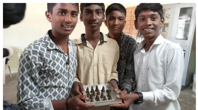
Dhoop Stick from waste flowers