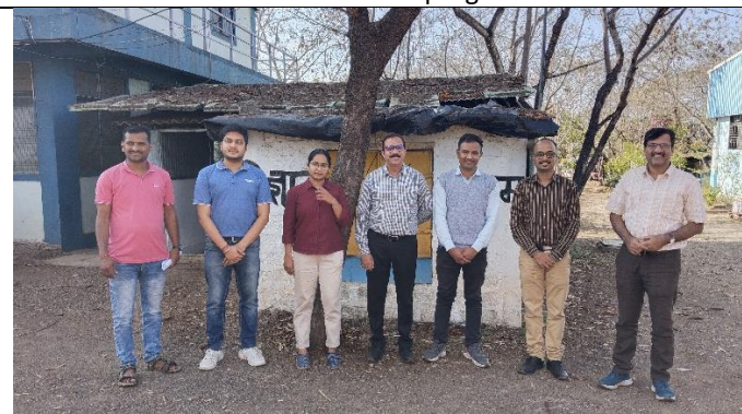
Visit of Mahle CSR team to VA

For Regular update: www.facebook.com/vigyan.ashram.pabal ; www.vigyanashram.blog www.vigyanashram.com ; https://vigyanashram.online/