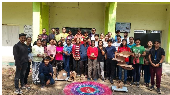
Students from Anand Niketan, Nasik doing 3 days training