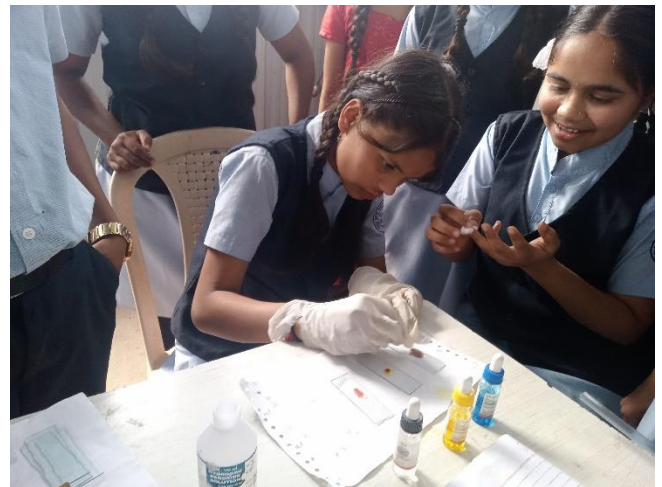
Blood group testing