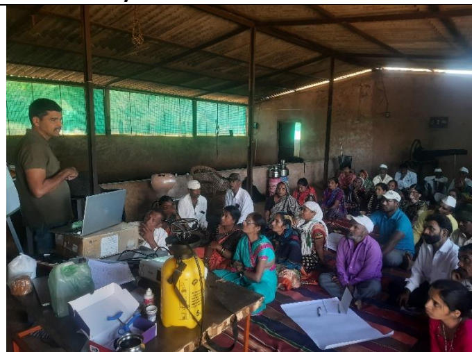
Poultry training @ fanshi