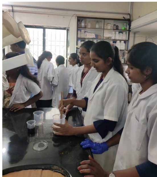
Science of Soap workshop