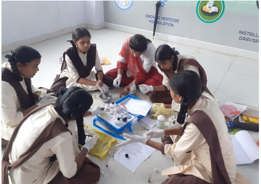
Soil testing @ Nigade School