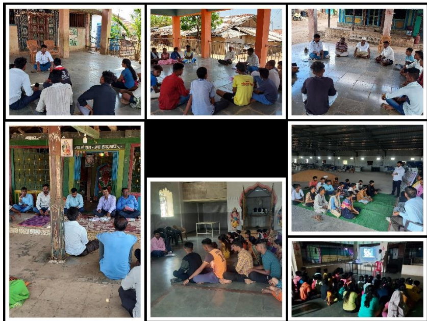
DBRT Promotion campaign