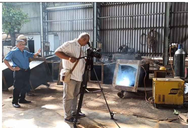
TIG & MIG Welding video shoot

For Regular update: www.facebook.com/vigyan.ashram.pabal ; www.vigyanashram.blog www.vigyanashram.com ; https://vigyanashram.online/