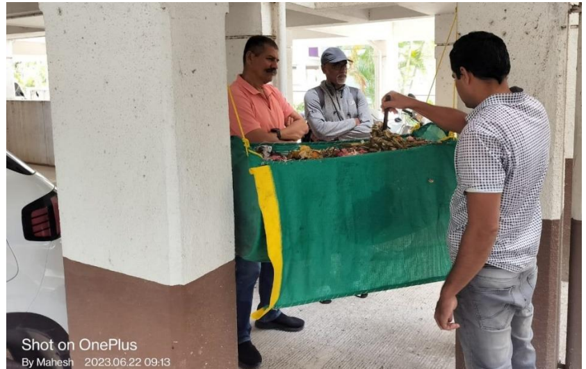
BSF hanging bags in society

In the month of June, total of 390 kg waste was processed in the society by using 4.8 kg (5 day old) larvae. (VATF)