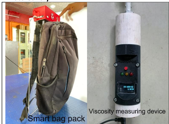
Fab Academy project