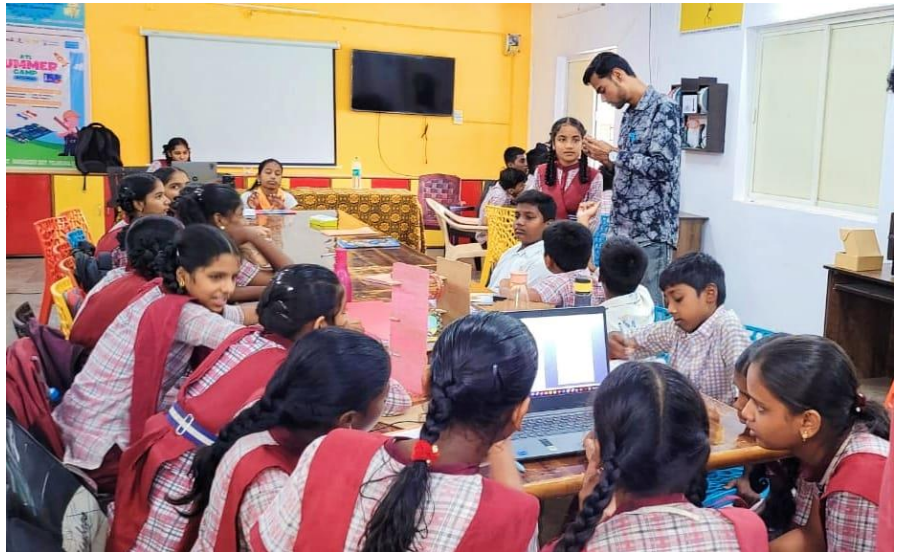
Summer camp @ Karmanghat