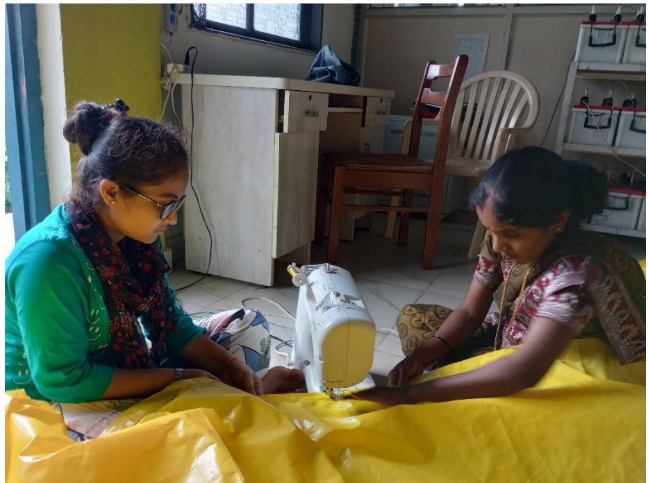
Sewing cover for big CNC machine

Home & health section: During June, students processed 28 kg bread flour in bakery, completed kitchen order of 15.66 kg spices, Tamarind sauce (4 kg). Total sales of for June was Rs.2940.00. Girls also provided tea & snacks facility during IBT training with community service value of Rs.10475/-. Students stitched cover for CNC wood routing machine.