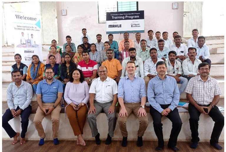
Visit of CSR team from M/s Mahle Engineering