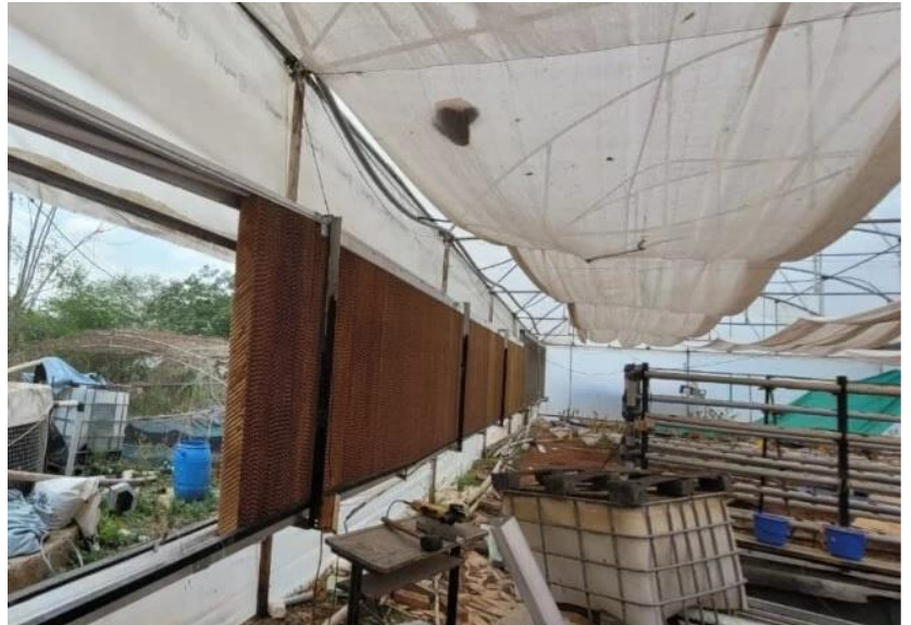
Polyhouse Fan Pad system under construction