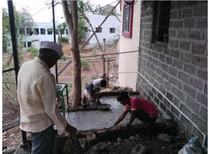
Masonry and flooring

3) Agriculture & Animal husbandry section: Regular activities in agriculture and animal husbandry dept are in progress. Students harvested 70 bundles of methi, 17 kg of maize seeds, 15 kg brinjal, 4 kg alu-leaves in farming section. Students also learnt fertilizer dose calculation while applying water soluble (Potassium Phosphate) fertilizer to guava plants. Harvested 8kg grass, 30kg Rajagira grass, 10kg makkhan grass for fodder.