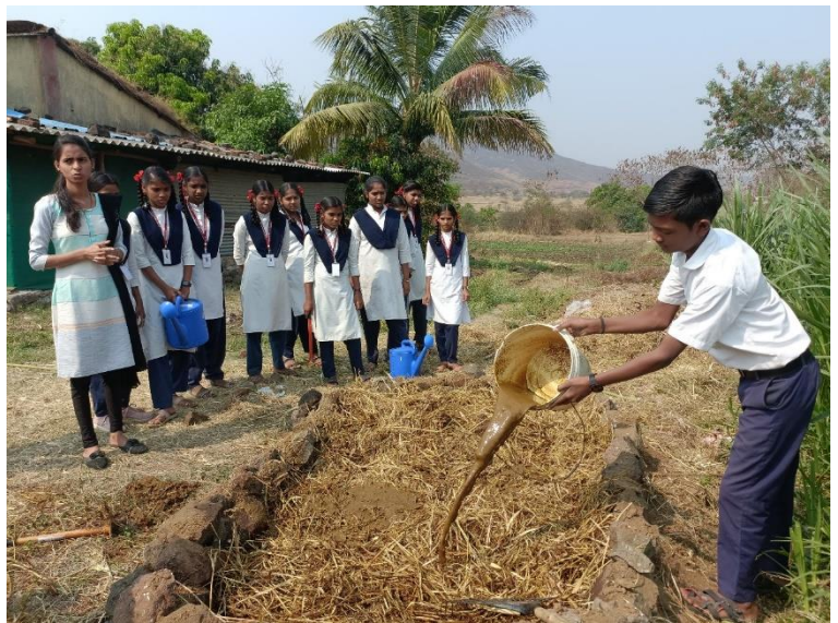
Students making composting bed