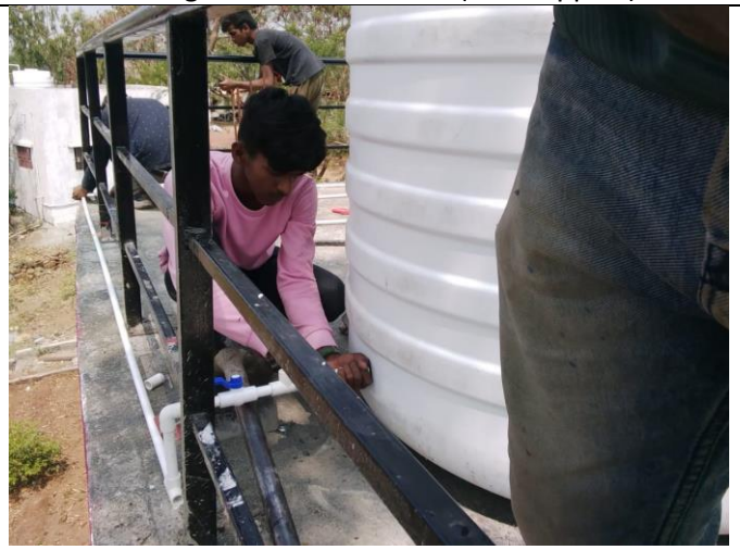
DBRT Plumbing work on food lab

For Regular update: www.facebook.com/vigyan.ashram.pabal ; www.vigyanashram.blog www.vigyanashram.com ; https://vigyanashram.online/