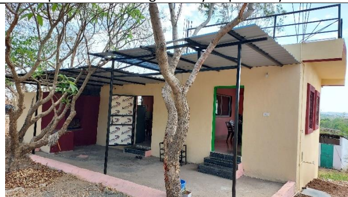
Newly constructed Food lab (SPA Support)