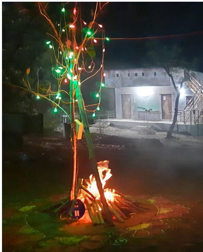
Holi without burning dung cake and wood

JJ Data Report: https://docs.google.com/spreadsheets/d/13y0XPGri0PEOlrX5Zeuk9VBArb-f4b_Q/edit?usp=sharing&oid=101141840668207826730&rtpof=true&sd=true