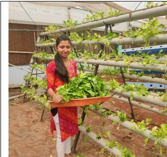
Spinach harvesting from hydroponics system