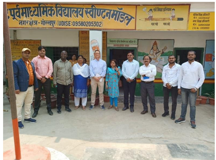
Visit by Unicef officials