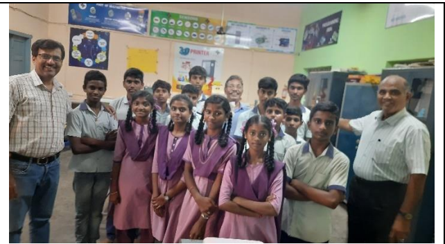
@ ATL korukonda