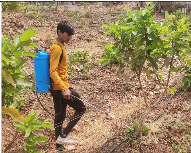
Drenching of Guava plants