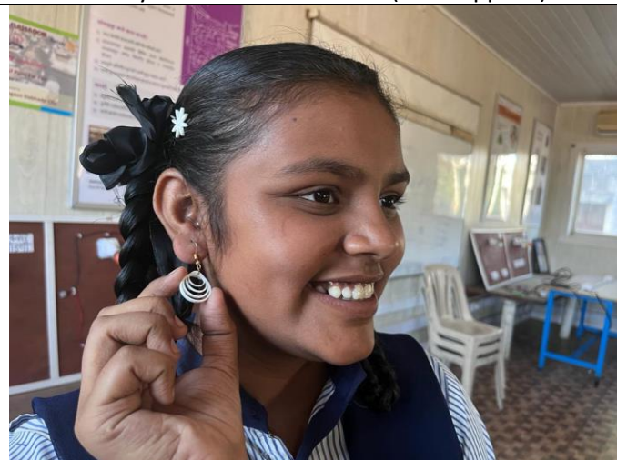
3D printed jewellery @ Shriram Vidyalaya