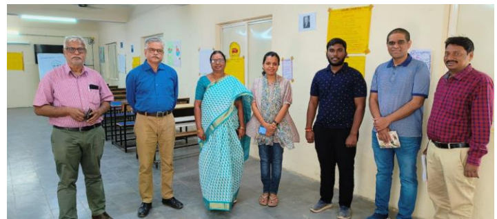
State ATL school selection visit @ Karanghat