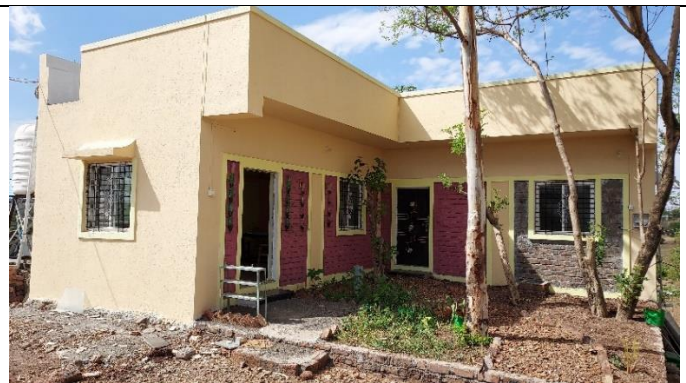
New Agriculture Classroom (SPA Support)