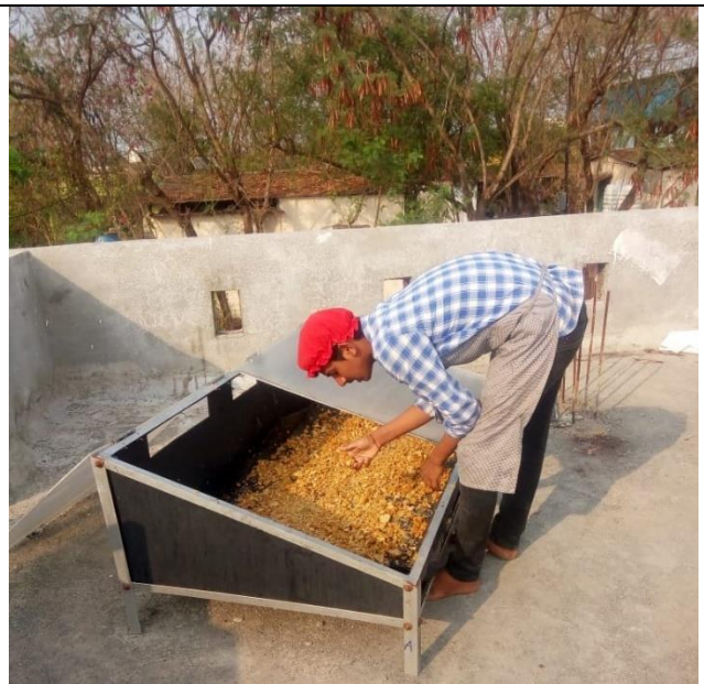
Food lab drying Pooran mix