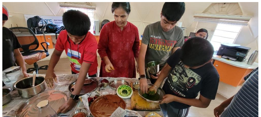
Natural colours for Holi