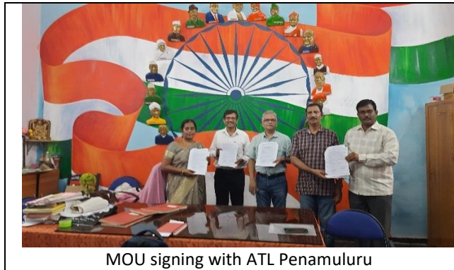
MOU signing with ATL Penamuluru