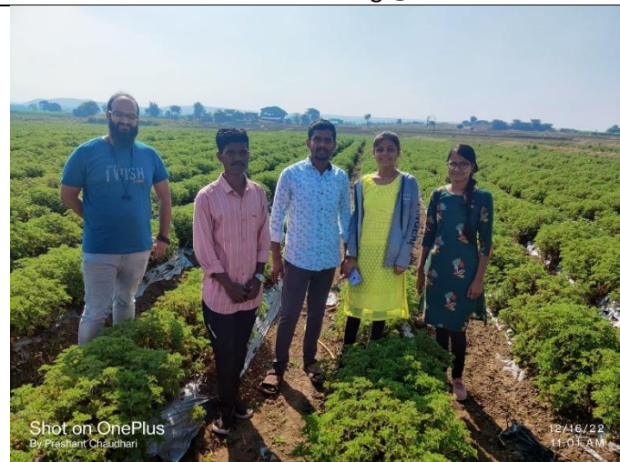
DIC students field visit : Geranium farm