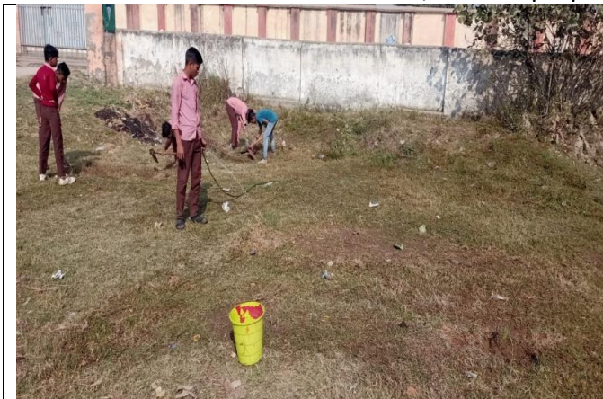
Before Land preparation for agri activities