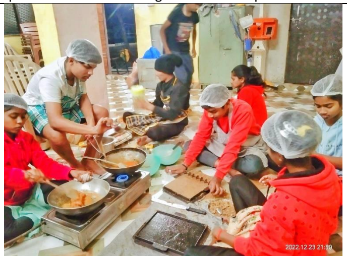
Chikki production by DBRT students

For Regular update: www.facebook.com/vigyan.ashram.pabal ; www.vigyanashram.blog www.vigyanashram.com ; https://vigyanashram.online/