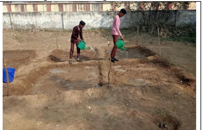
After Land preparation