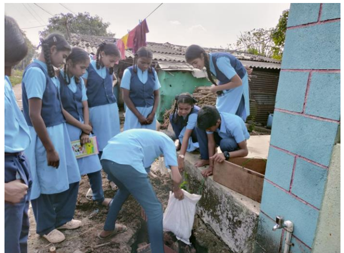
Earthing camp in village : Sangise school