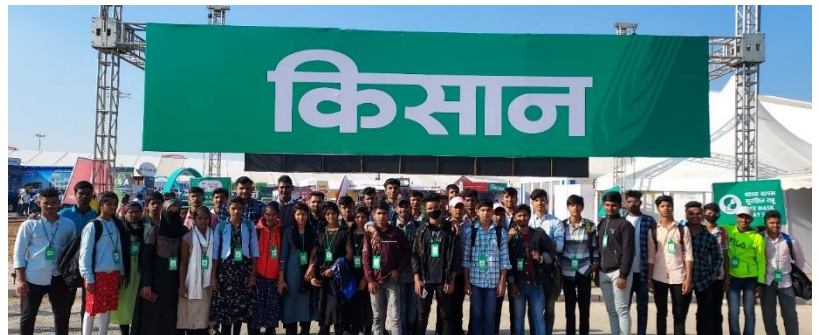
DBRT students @ Kisan