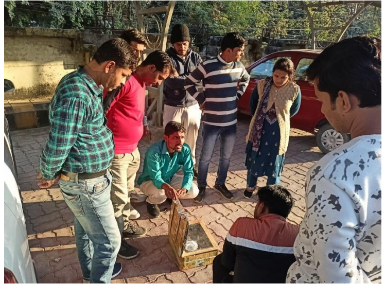
Solar cooker training @ Instructors training