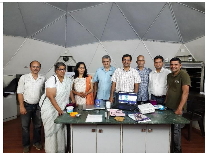
Stars forum meeting at DIY Lab