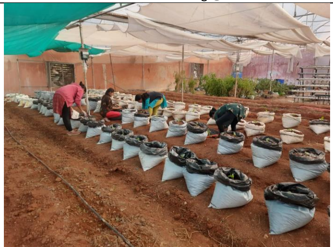
Experiment for effect of organic carbon on plants