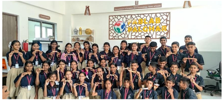
Fab camp participants @ Palghar Lab