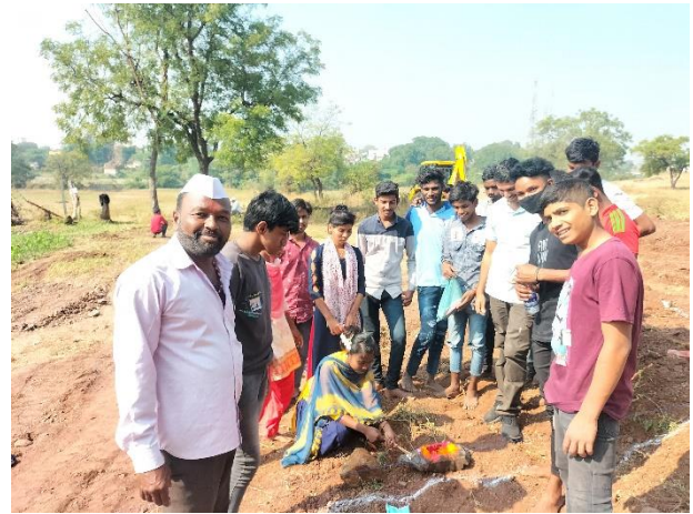
Ground breaking ceremony for new hostel

iv) Workshop section: Students fabricated Newspaper reading stand (Rs.1271). Plumbing work of WC unit, overhead tank & water taps (Rs.7492) and brick laying work of agri section (Rs.6932) in newly constructed agriculture classroom. Hrshikesh fabricated a staircase for recreation centre with cost of Rs.27,497 (labour charges Rs.4261.00). Ghanshyam completed renovation of roof for new food-lab [Rs. 39395.00 (labour charges Rs.7000)].