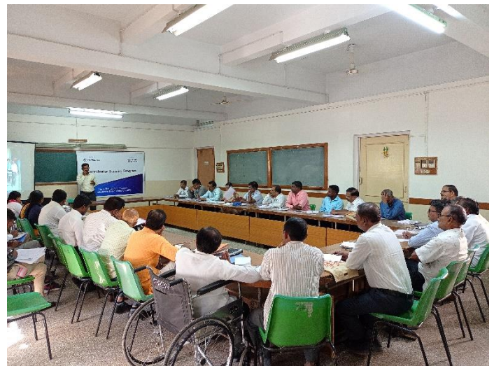
IBT co-ordinators training