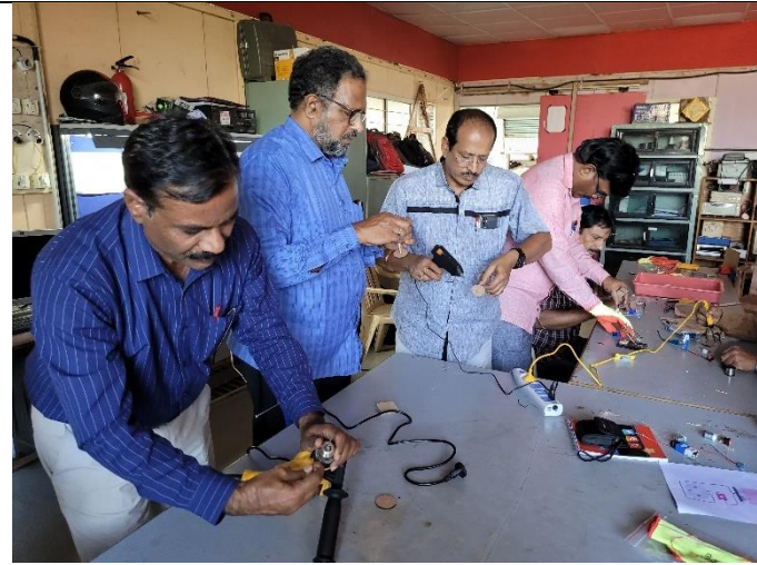
ATL teachers training @ Pabal