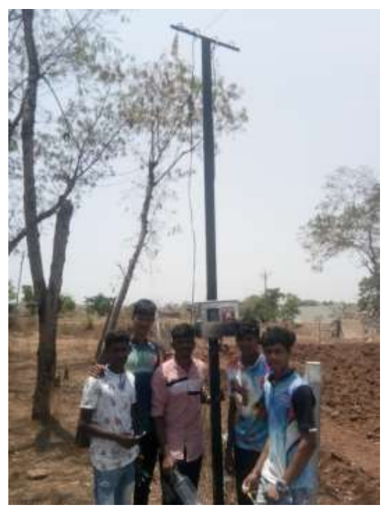
New electric connection @ farm