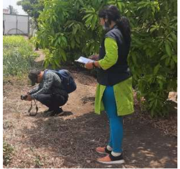
Shooting of composting training