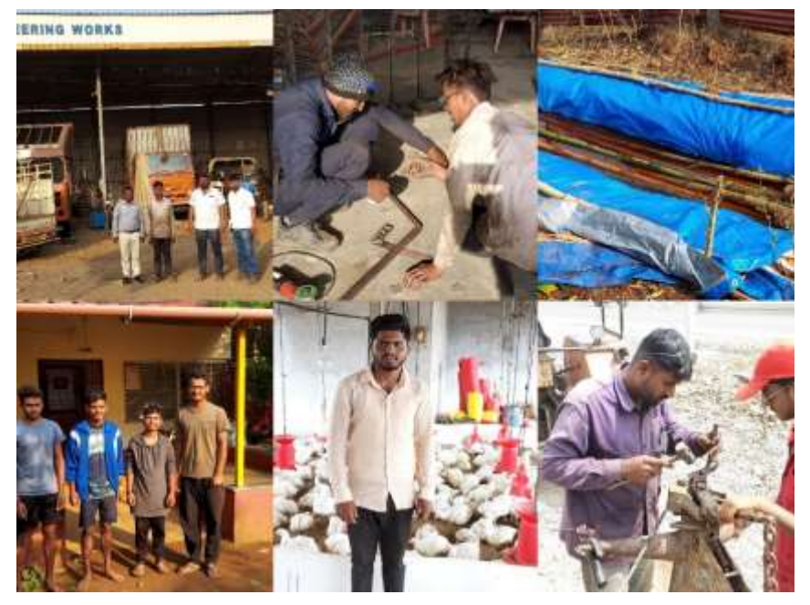
DBRT students @ place of internship

From this year, we have introduced short term 'summer internship' for DBRT students. Students will be placed for 6 weeks with entrepreneurs in Vigyan Ashram network. In the month of April, we have placed 40 students for internship with various entrepreneurs. Instructors are visiting interns at their workplace. Remaining 14 students are completing their course work at Pabal campus.