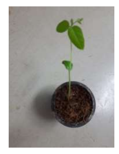
First plant (Gokarna) for hardening from tissue culture lab