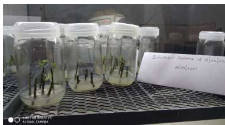
Tissue Culture Plants

iv) Tissue culture : We have got some success in controlling contamination of plants. We got good results using Bavistin fungicide along with Tween 20 which is the surfactant. Now we have 44 rose explants without contamination.