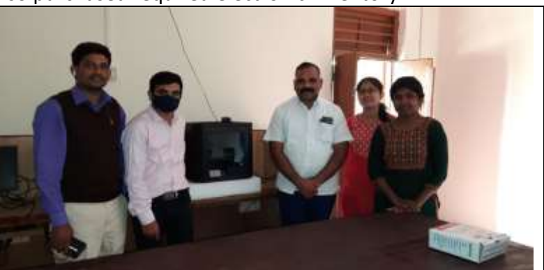
Installation of 3D printer @ Mukhai school