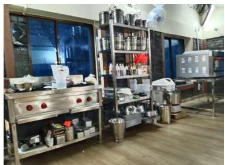
Bakery @ Dantewada

Ambegaon (Pune) in the name of 'Shrushti Poultry Farm'. Sagar is beneficiary of 'online poultry farming EDP' program. At present he has farmed 13600 broiler birds & also planning to increase capacity in near future.