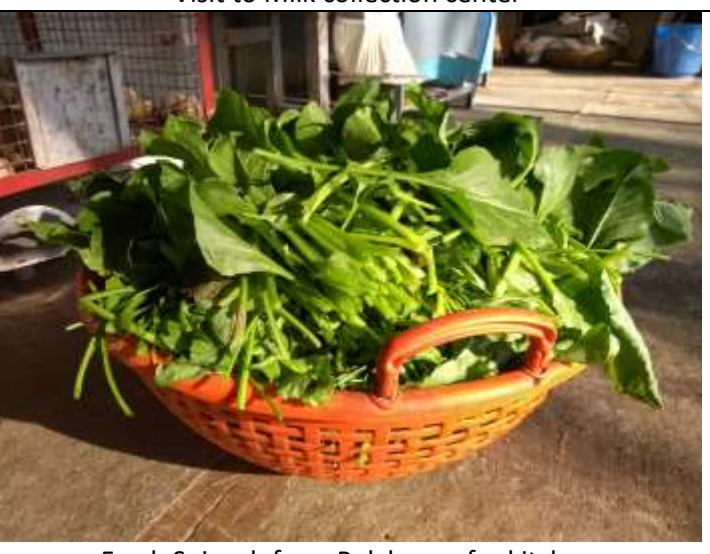
Fresh Spinach from Polyhouse for kitchen

For Regular update:www.facebook.com/vigyan.ashram.pabal;www.vigyanashram.blogwww.vigyanashram.com