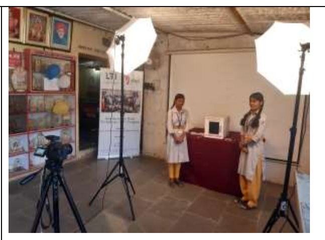
Video Shooting of IBT projects for Technovision