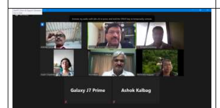
Management committee meeting 17<sup>th</sup> Jan