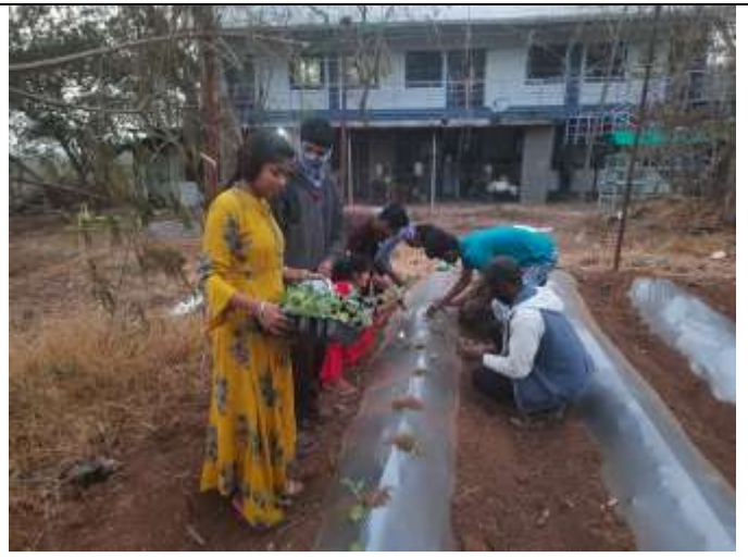
Tomato plantation plot