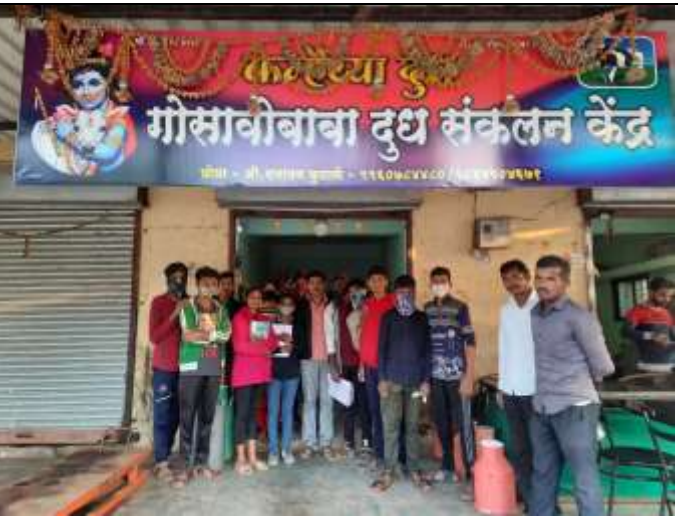
Visit to Milk collection center