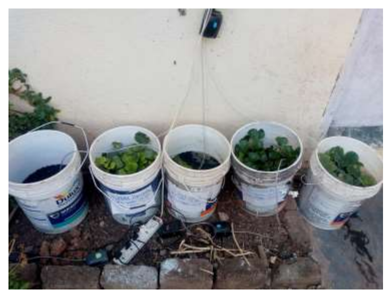
Black water testing Setup

Suhas & Sanket installed climate control