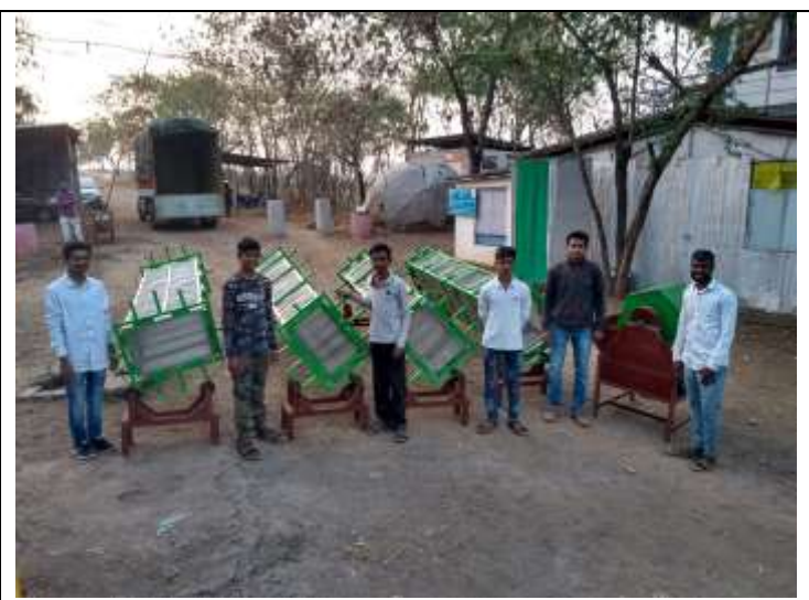
Composter Stacking system and composter was dispatched on 26<sup>th</sup> Jan