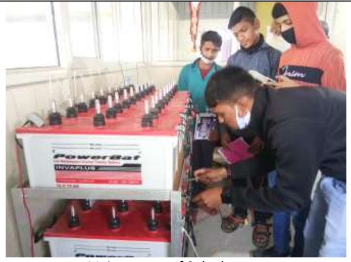
Maintenance of Solar battery