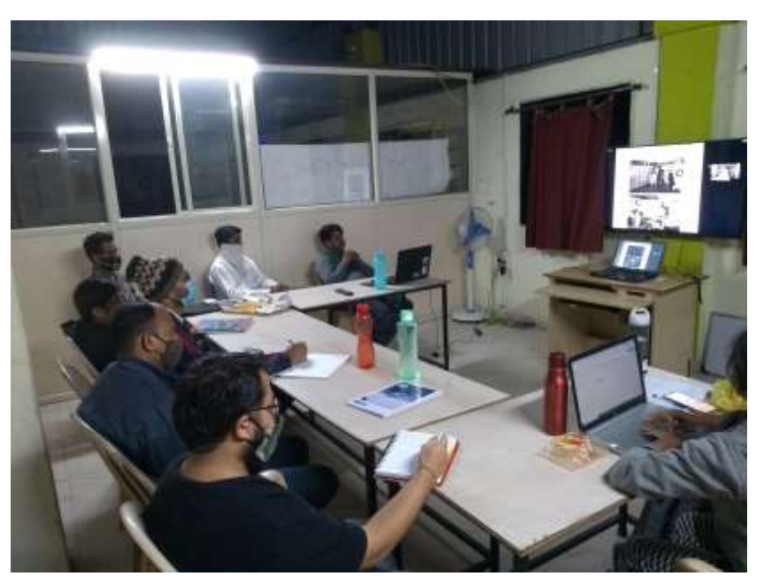
Fab Class on Every Wednesday @ 6.30pm