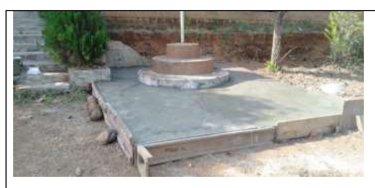
Foundation top for flag post @ Amboli