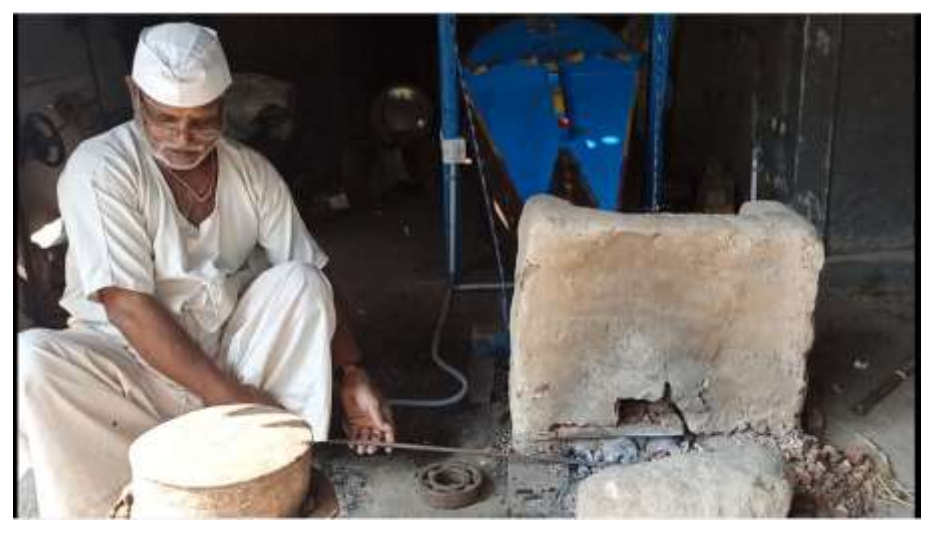
Blacksmithy blower powered by Solar Energy

cost of the equipment's and rest amount came as a subsidy from SELCO foundation. DBRT Students were involved in installation of solar