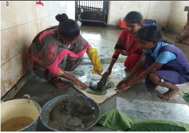
Students of Padsare Schools learning ferrocement