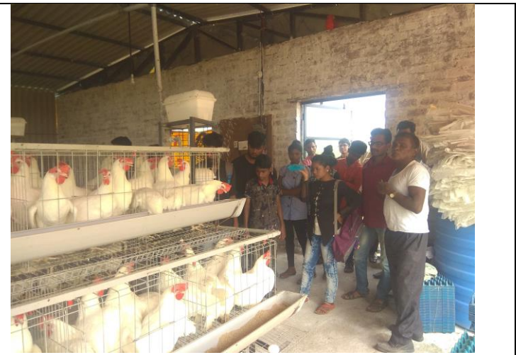
DBRT students visiting layer poultry farm @ Uralikanchan