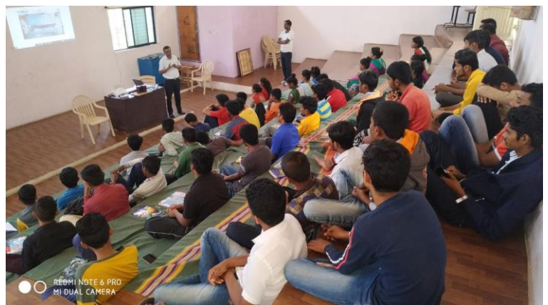
Safety training for DBRT

guided students on various new skill training opportunities & carrier options. We are thankful to BAJAJ electrical team for their support & guidance to students.