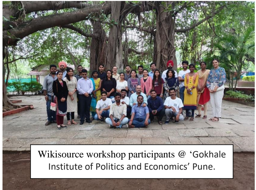
Wikisource workshop participants @ 'Gokhale Institute of Politics and Economics' Pune.

ix) www.dsttara.org – 1093 (New visitor –945 Repeated- 148), www.vigyanashram.com – 1050 (New visitor – 854 Repeated-196)