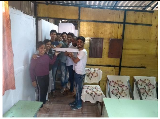
Team responsible for the makeover