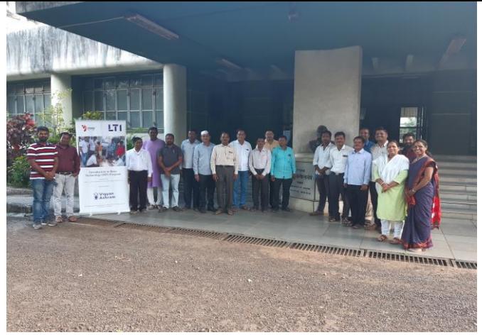
review meet of LTI supported IBT schools.