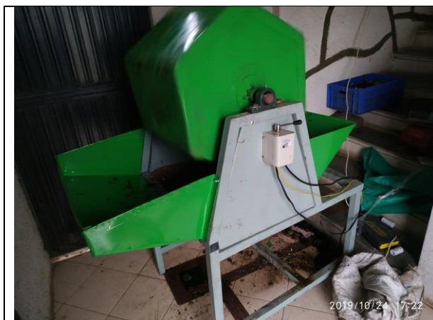
Hexagon shape housing society composter