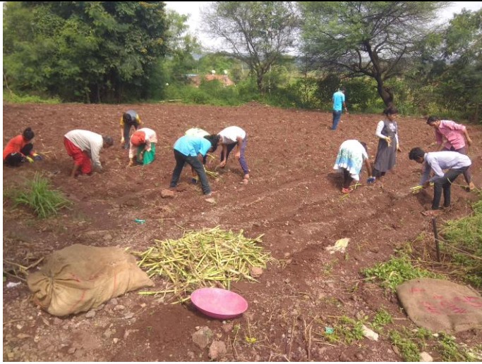
Plantation of Napier Grass (काडी गवत लावताना)