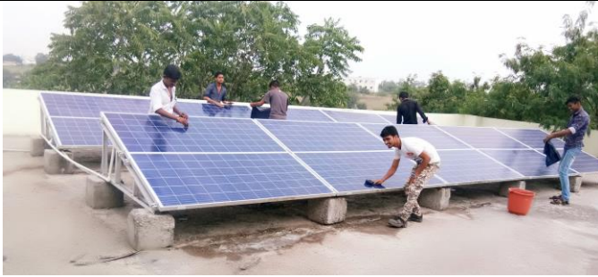
DBRT Electrical : Solar panel maintenance