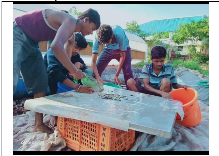
DBRT Students harvesting fish from aquaponics nursery