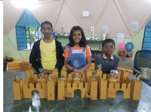
DIY Lab students with laser cut 'Diwali forts'