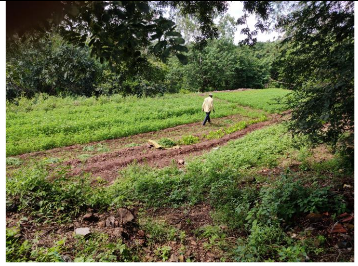
Lucerne grass cultivation (लसूण घास चे क्षेत्र)