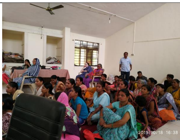
Bio-waste composting awareness @ Alandi