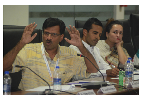
Round table on Social Entrepreneurship