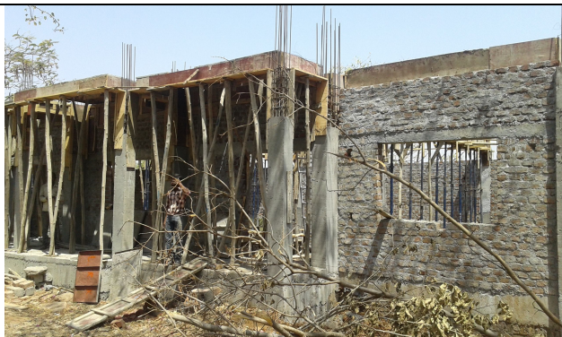
Status of construction

For Regular update: www.facebook.com/vigyan.ashram.pabal