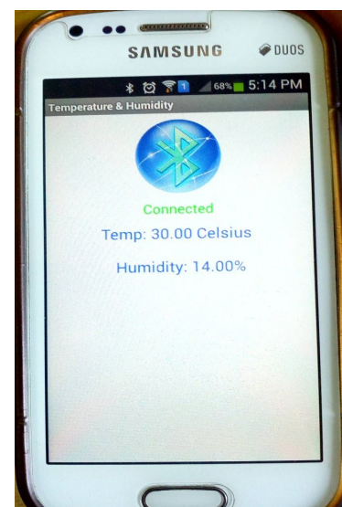
Display of sensor kit on mobile apps