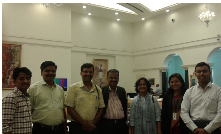
DIC team at Rashtrapati Bhavan