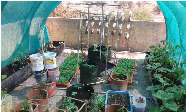
Terrace garden on hostel roof