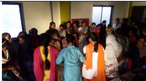
Women's Day celebration at VA