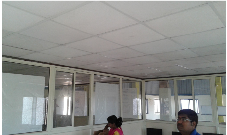
Computer Lab Ceiling