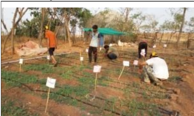
Agriculture trial : Onion