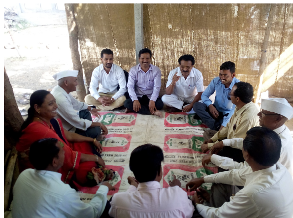
IBT committee meeting