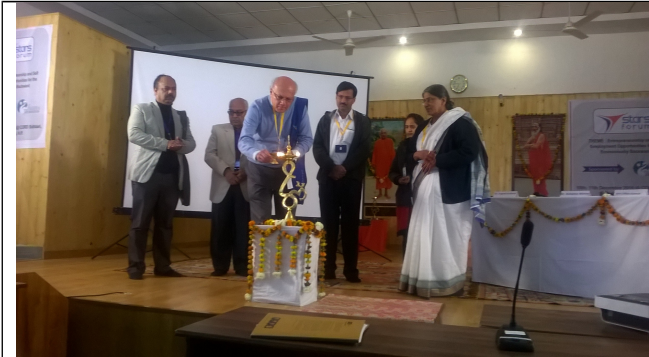
STARs forum at Dharmashala