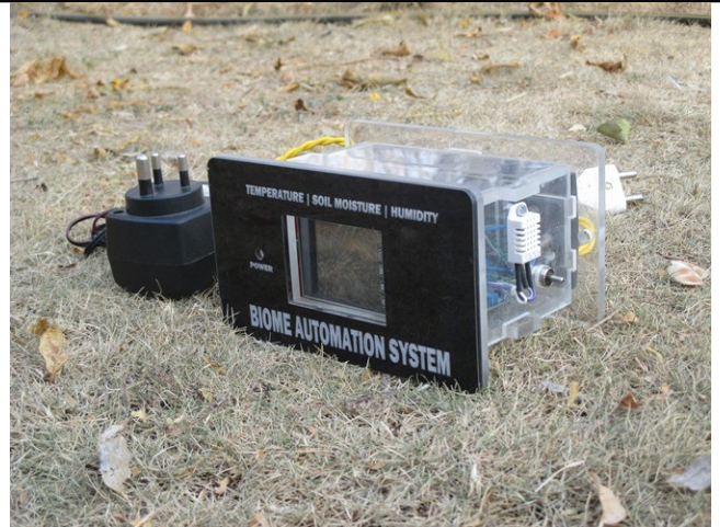
Fab Product : BIOME automation system

For Regular update: www.facebook.com/vigyan.ashram.pabal