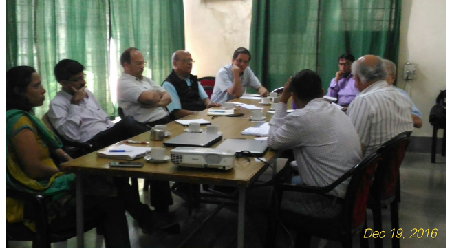
Skills on Wheel - Brainstorming meeting on 19 th Dec.