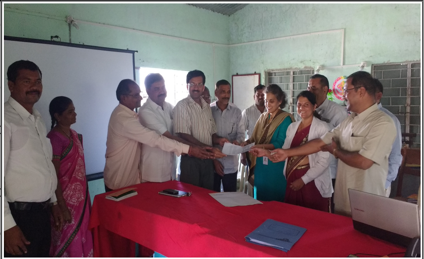
MOU Signed with L&T Infotech CSR