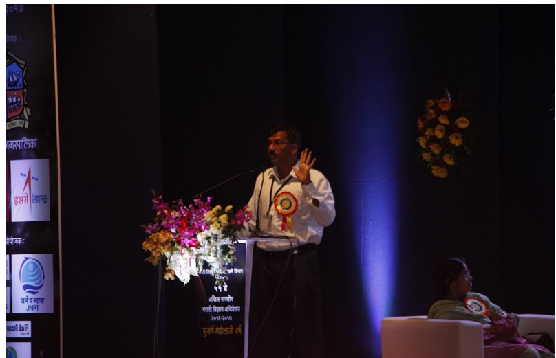
At Marathi Vidnyan Parishad