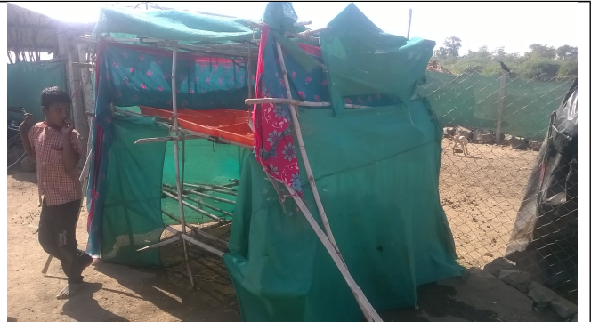
Hydroponic unit installed at Sinnar