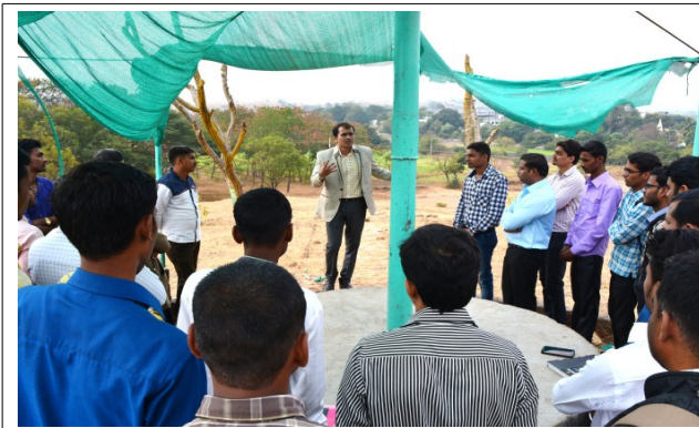
Entrepreneuership training at Pabal

'Entrepreneurship development' workshop was conducted from 15 th to 18 th December at Pabal Campus. It was attended by 45 participants. Topics discussed are :- business planning, finance management, marketing, bankable proposal making etc. We have experts from DeAsara, 111Startsup, RangDe, SV Prommeans as faculty for the program.