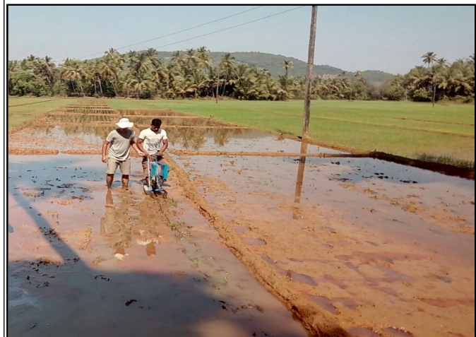
Testing rice planter in rice field