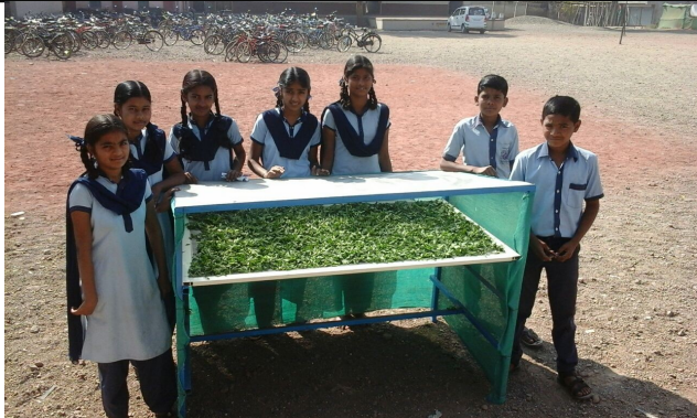
Dryer made @ Pargaon IBT school