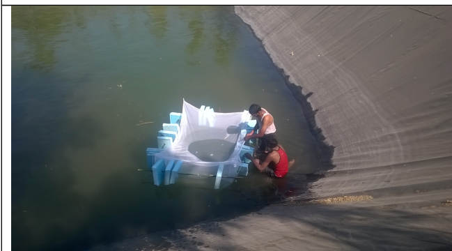
DBRT : Fish farming in farm tank