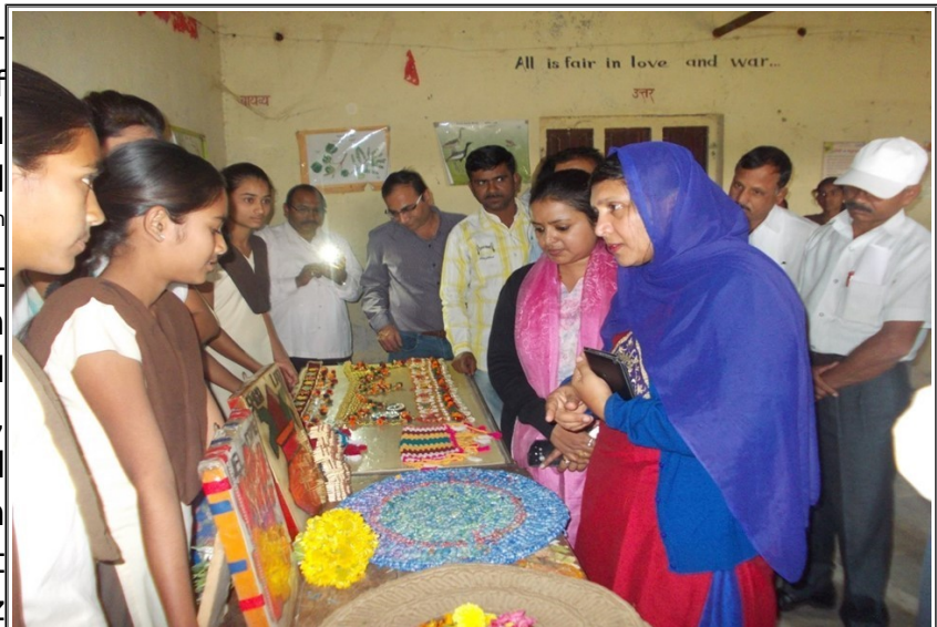
Suzlon CSR team visiting IBT school for 360 degree review

instructors, School admirations, parents etc. The progress is satisfactory and we are planning to improve it further.