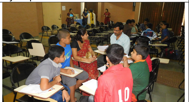
Project making workshop at Mukangan