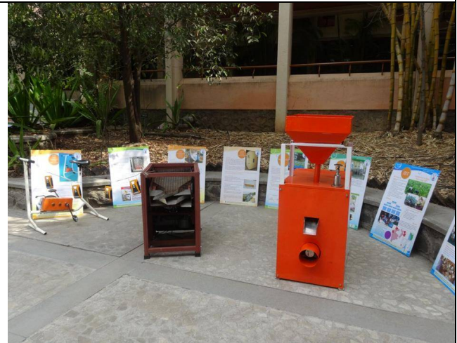
VA exhibit during DST GMW workshop