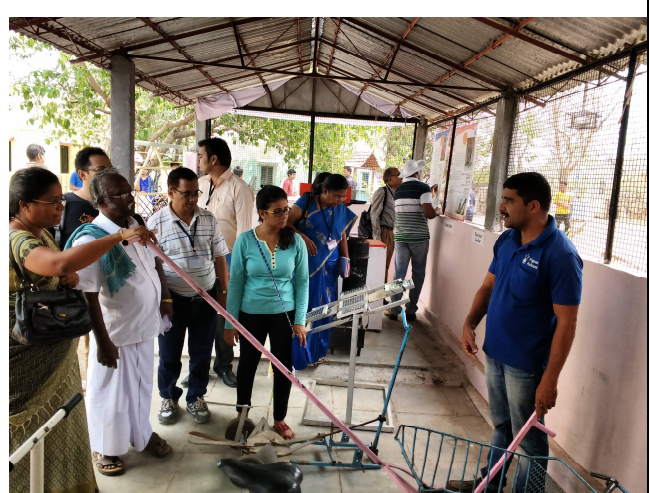
DST Core members visit to Vigyan ashram Campus

For Regular update: www.facebook.com/vigyan.ashram.pabal