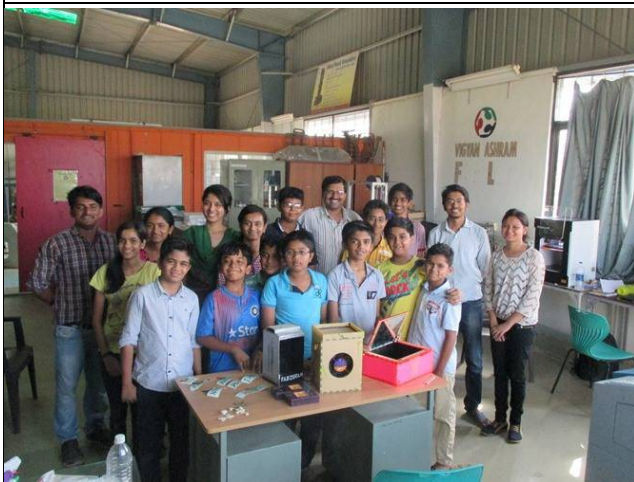
Fab-Ed workshop students with their design projects.