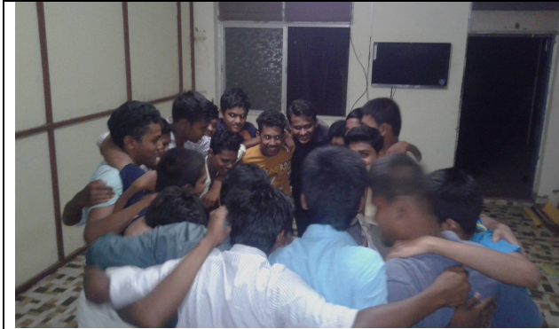
Evening Discussion : Group activity