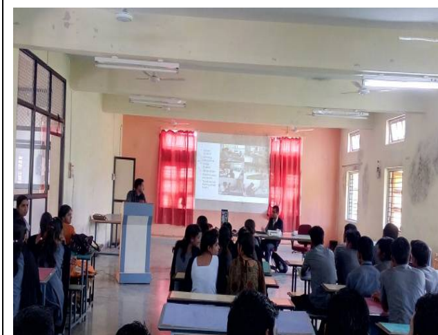
Rural Entrepreneurship awareness camp @ ITI Ghodegaon.