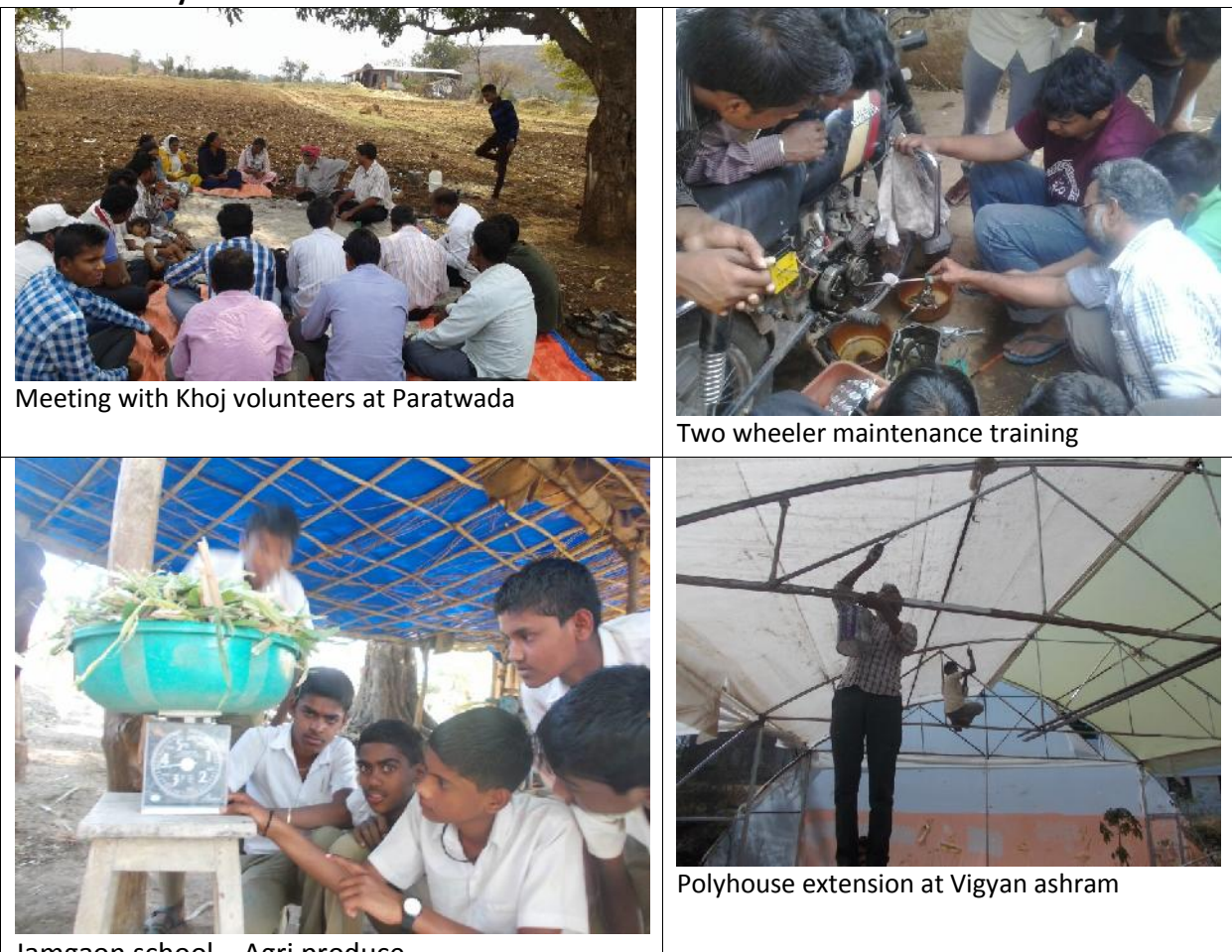
Jamgaon school – Agri produce

For regular update :<u>https://www.facebook.com/vigyan.ashram.pabal</u>