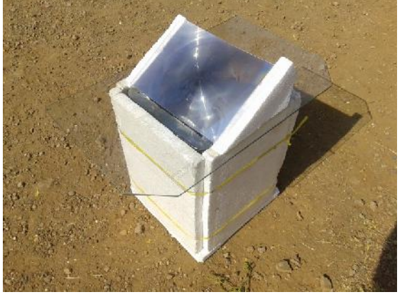
Failed Experiment : Making solar cooker using Fresnel lense.