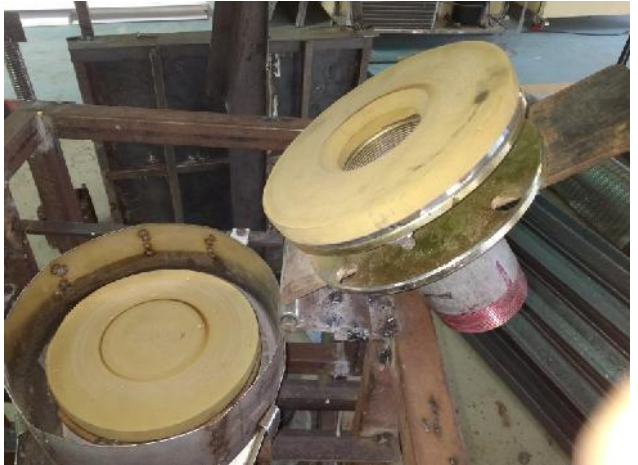
New plates for rice dehusking

ii) High density fish farming (RAS) experiment- In aquaponic experiment the problem negative FCR is resolved by reducing fish density and fixing new bigger capacity ventury(as air suction valve). With this FCR is improved to 1.34, now individual fish is weighing around 67 Gm. iv) Foldscope workshop – Vijay and Ganesh attended workshop on making Fold scope at Delhi on 16<sup>th</sup> Dec. This is simple microscope developed by