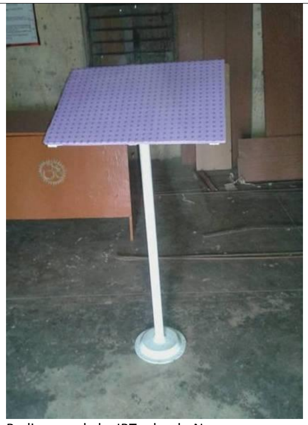
Podium made by IBT school - Nawapara