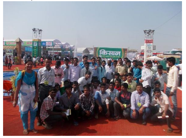
DBRT team @ Kisan Exhibition

Livelihood college, Balarampur(CG) send 13 tribal students for 3 months poultry training course starting from 15<sup>th</sup> Dec. They will raise poultry and also undergo training on Egg incubator. The course is sponsored by District Collector, Balarampur.