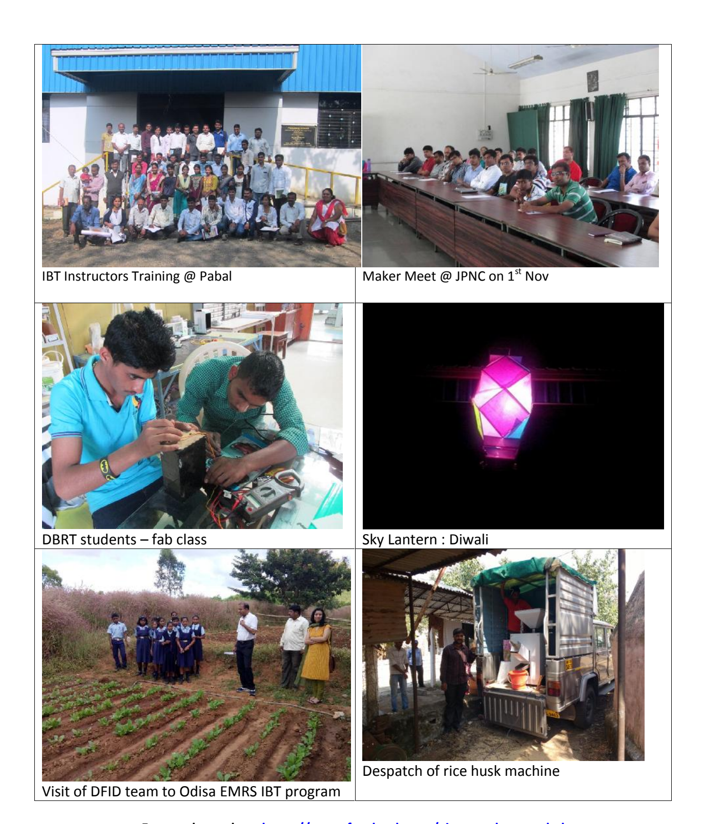
For regular update : <a href="https://www.facebook.com/vigyan.ashram.pabal">https://www.facebook.com/vigyan.ashram.pabal</a>