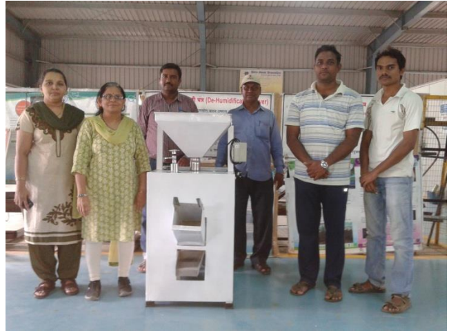
Rice Dehusking Machine Despatch

To train our staff in computer aided design, we have started Auto-CAD and Catia training. We have hired external faculty and they will conduct the course on Saturday & Sunday. At present 6 staff members are undergoing training. The CAD designing will help us to adopt new machine tools and practices required in 'digital fabrication'.