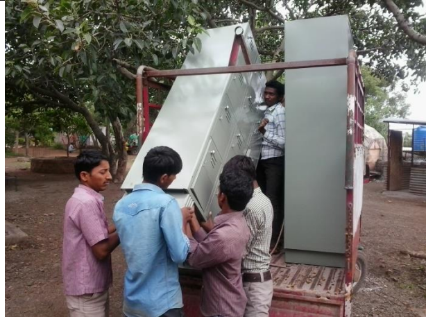
DBRT hostels : New furniture for new batch