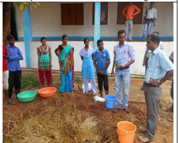
Collector , Dantewada visited IBT Training

For regular update : https://www.facebook.com/vigyan.ashram.pabal