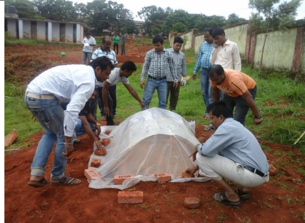
Humidity chamber Practical's : IBT Training