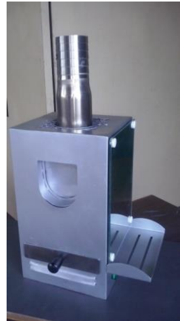
WOMA VIVUS Incinerator

https://www.youtube.com/watch?v=pj709ecVh4E&feature=youtu.be