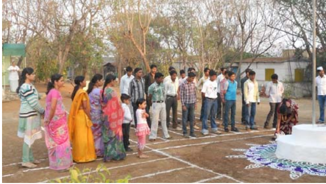
26 th Jan, Republic Day