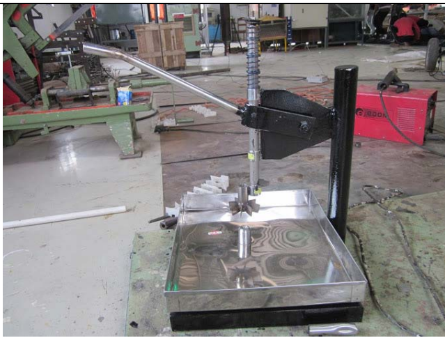
Amla cutter made in ashram