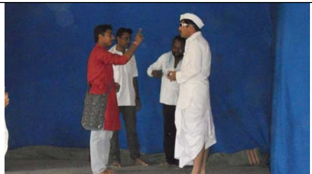
Cultural Program – 26 th Jan