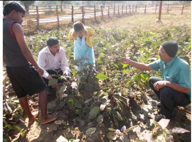
Instructor Training @ Dantewada