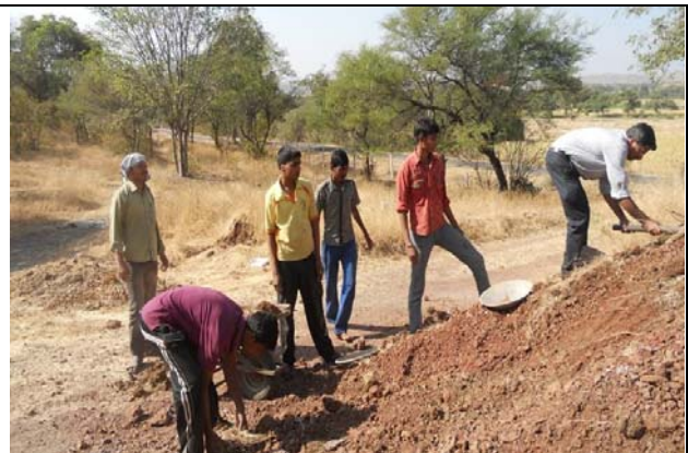
Shramdaan , 25 th Jan