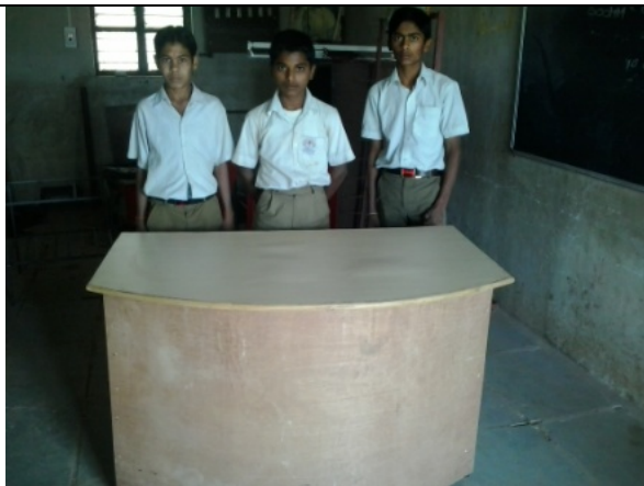
Table made in IBT practical