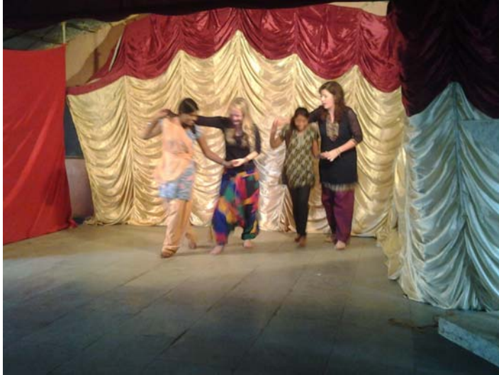
Students Cultural program at ashram