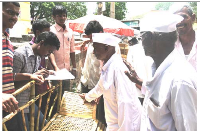
Display of bamboo chair in village market