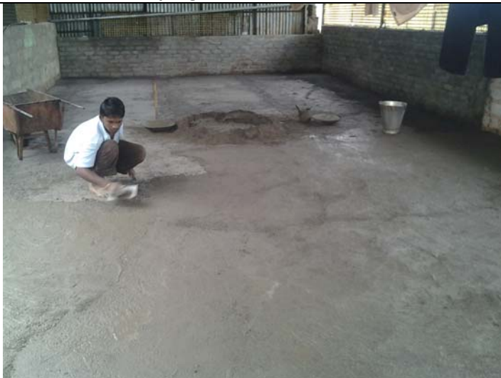
Goat shed flooring