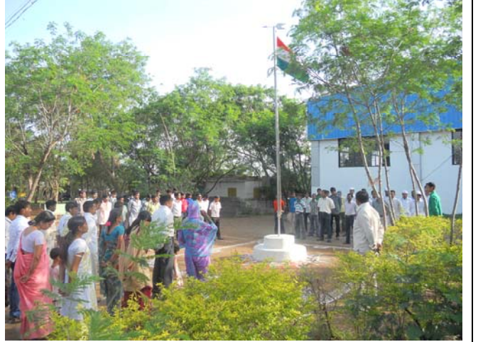
Independence day celebration