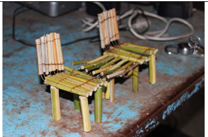
Prototype of chair