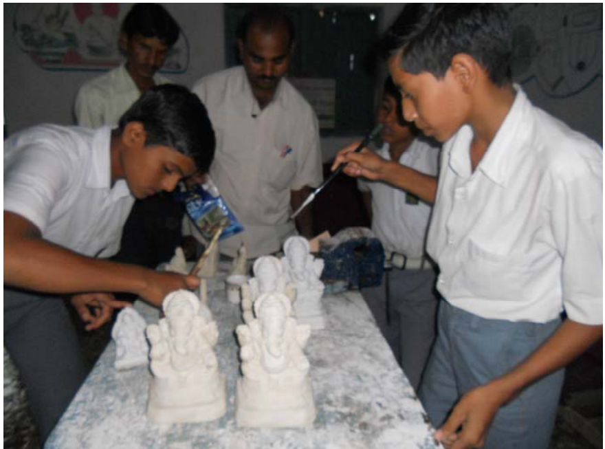
Ganesh Idol Making : Chadwel korde high school