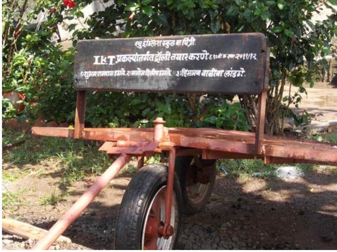
IBT project : Bargaon pimpri