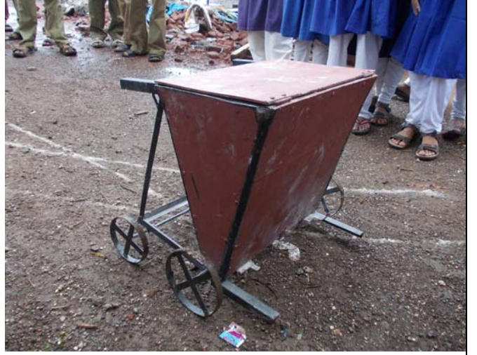
फक्की मारण्याचे यंत्र - बारगाव पिंप्री