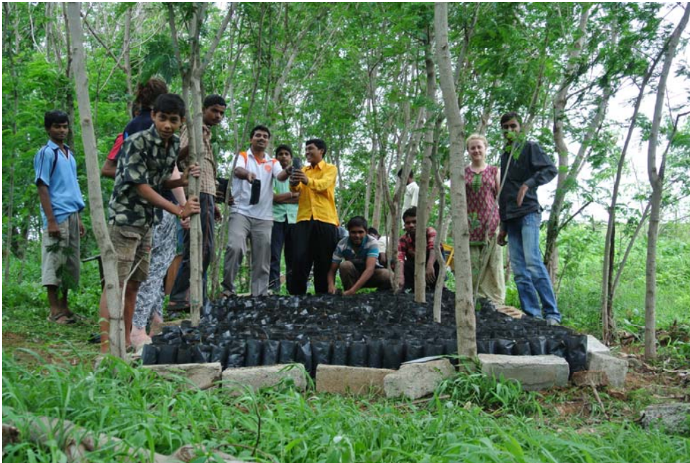
Figure 1 Shramdaan - Nursery work

b) 15 th Aug : Independence day - DBRT students prepared very hard for Independence day celebration. But due to death of union minister Mr.Vilasrao Deshmukh, program was cancelled on 15 th Aug. Only flag hosting was done on 15 th Aug. On 14 th Aug, staff and student did 'Shramdaan – श्रमदान' and prepared 1600 plants in the nursery.