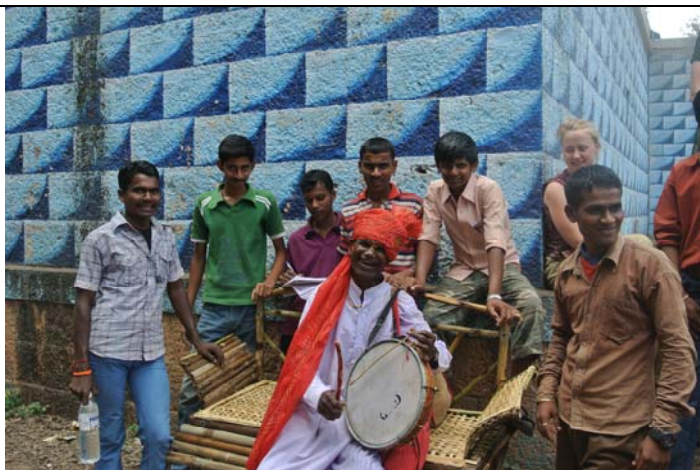
Display of chair in market