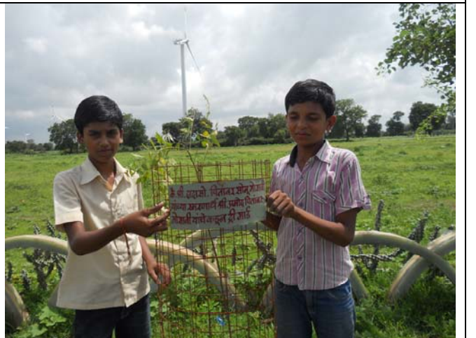
Amkhel School : 22 Tree guard made with the donation from villagers.