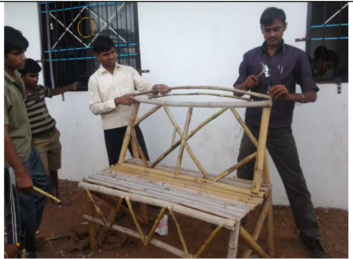
Bamboo chair manufacturing